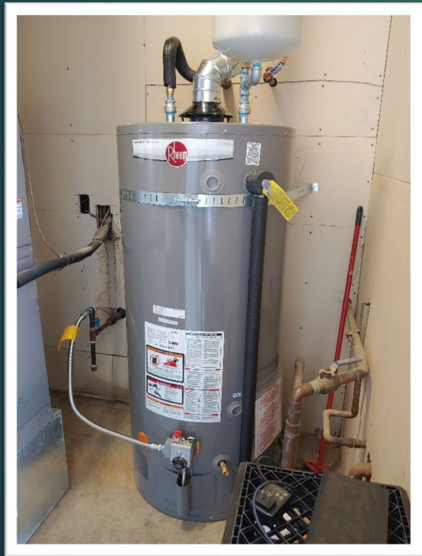
New Propane Hot Water Heater