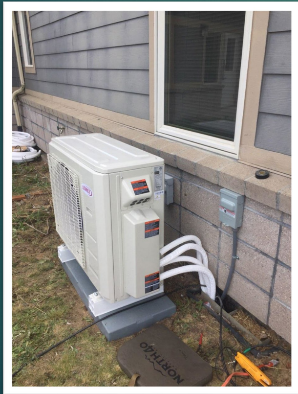
New Heat Pump – outside view