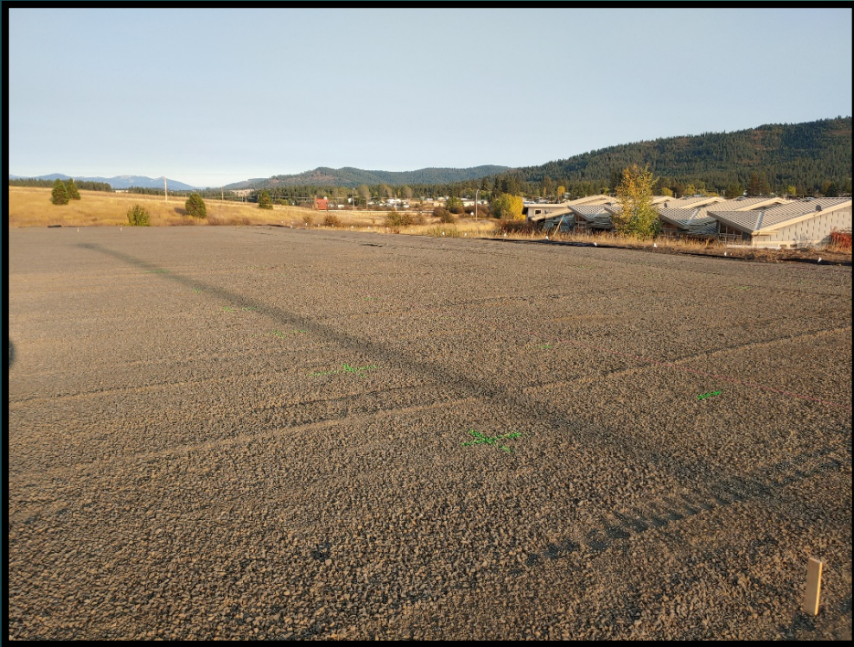
Staking the Site