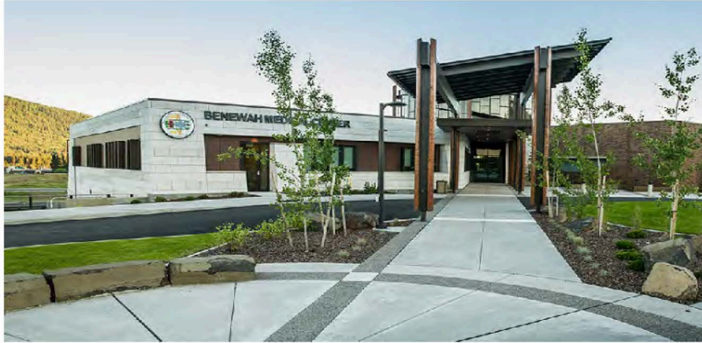
Coeur d'Alene Tribal Benewah Medical Center Front Entrance

Prepared for the Coeur d'Alene Tribe Environmental Programs Office in the Natural Resource Department by: