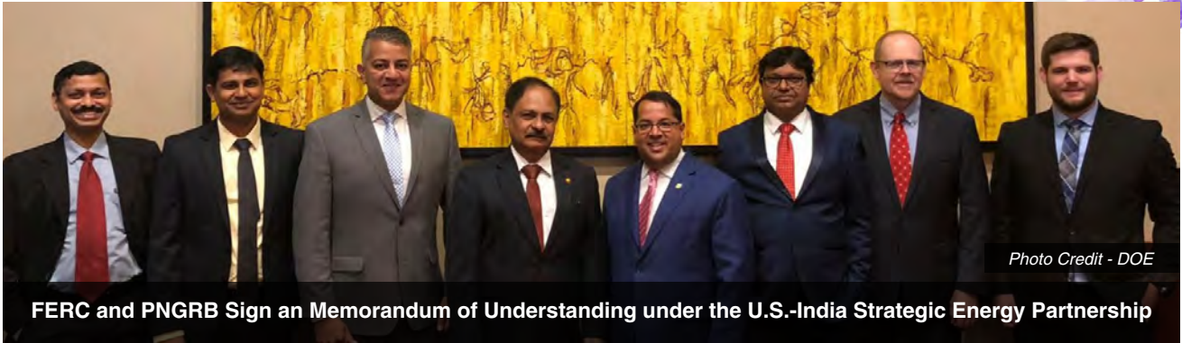
FERC and PNGRB Sign an Memorandum of Understanding under the U.S.-India Strategic Energy Partnership