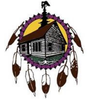
Sunrise Acres III – Supportive Housing for Homeless Veterans and Seniors with Special Needs