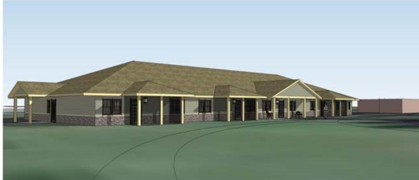
18 units of New Construction Serving Homeless Veterans and Seniors with Special Needs