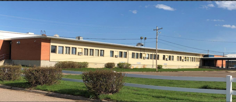
NORTHERN CHEYENNE TRIBAL SCHOOL