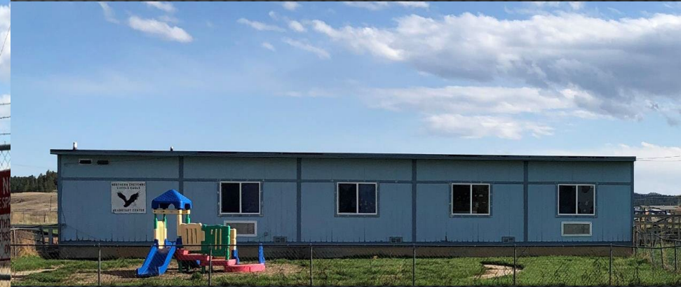
NORTHERN CHEYENNE LITTLE EAGLE HEAD START

PROJECTED TO SAVE THE TRIBE $43,000/YEAR