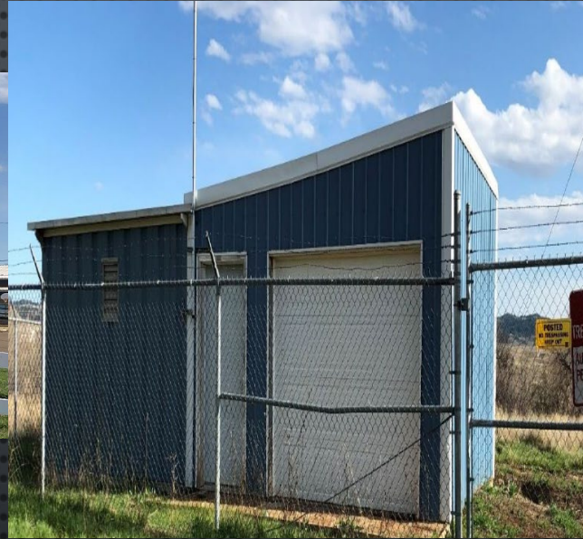
WATER PUMP HOUSE