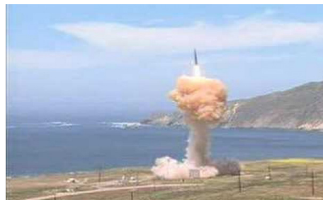
Ground-launched intercontinental ballistic missile