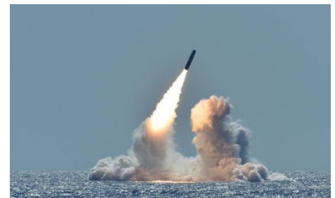
Submarine-launched ballistic missile