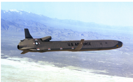
Air-launched cruise missile