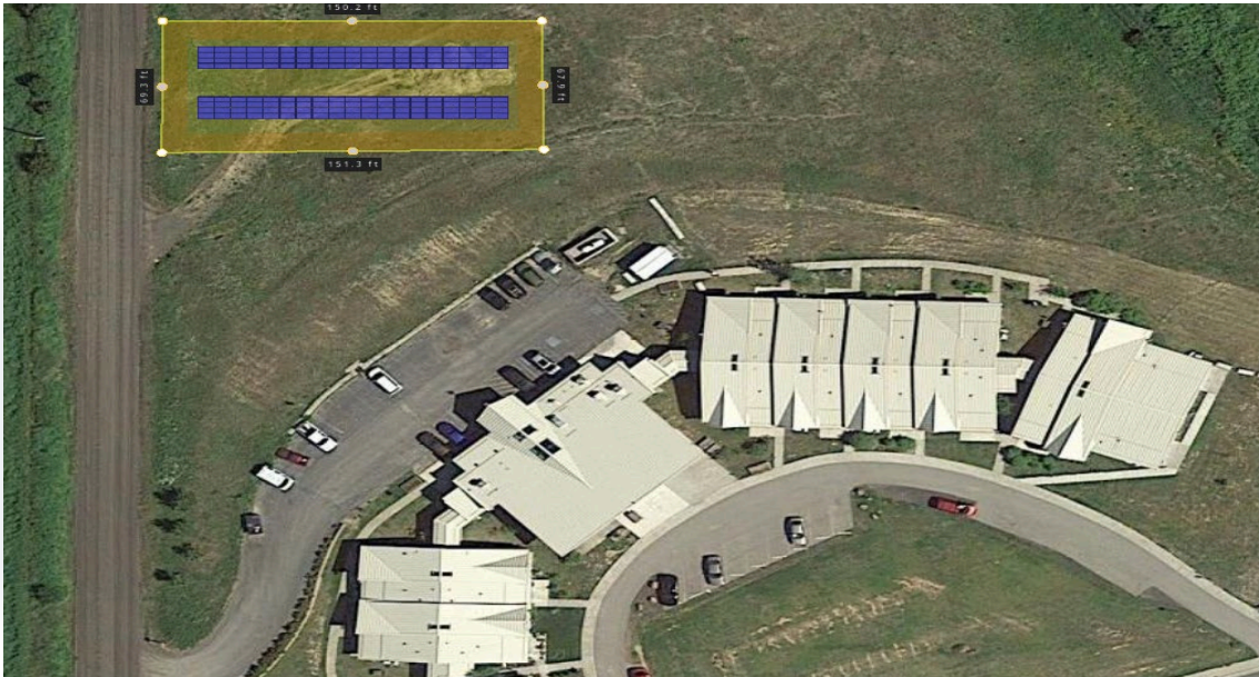
The combined solar and energy efficiency measures will help reduce the total cost of housing for Tribal Seniors.

The proposed project will integrate a 52kW solar PV system to the Senior Housing Complex in Plummer, ID. The project will also upgrade lighting, a water heater, and additional efficiency measures. The Tribe's long term energy goals include "improving the quality of life and providing social and economic benefits across the Reservation." These proposed measures move the Tribe toward a more sustainable energy system while providing benefits to its tribal senior residents.