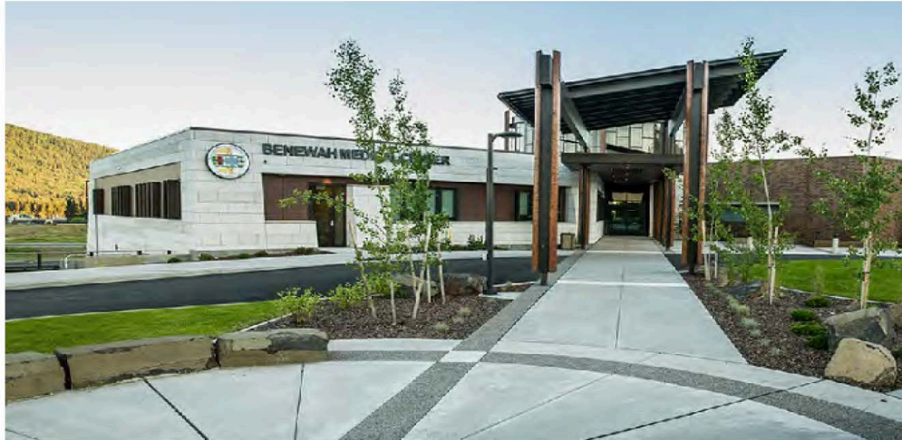
Coeur d'Alene Tribal Benewah Medical Center Front Entrance

Prepared for the Coeur d'Alene Tribe Environmental Programs Office in the Natural Resource Department by: