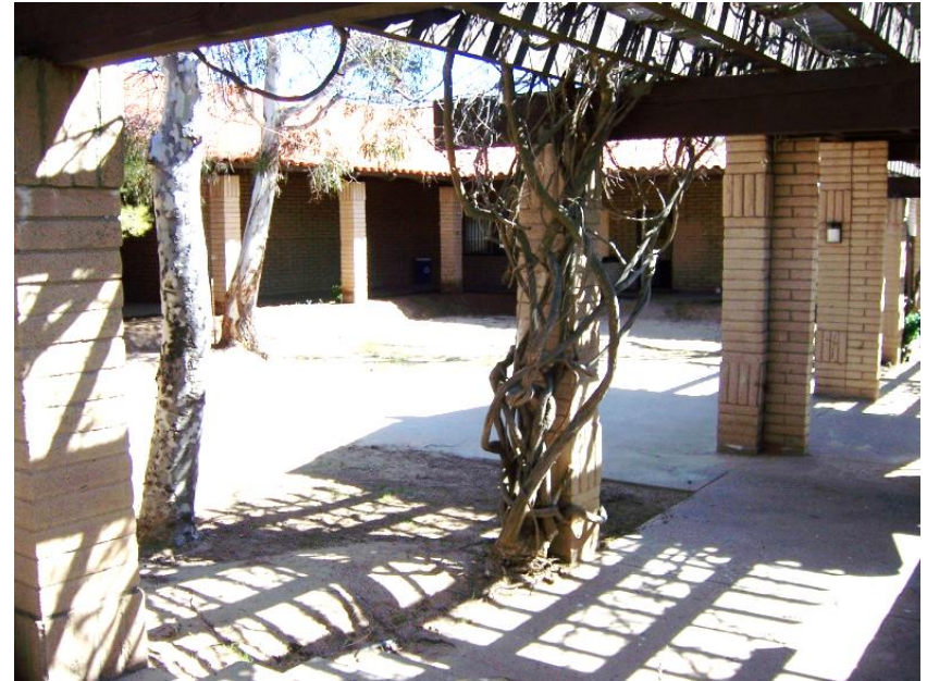
Courtyard of tribal government building