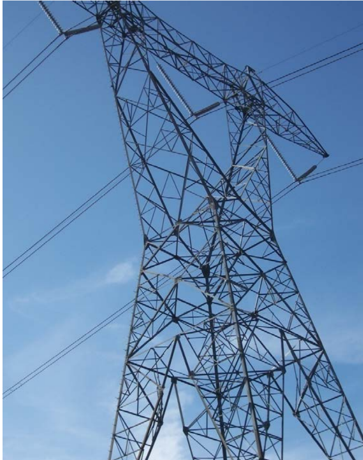
Southwest Powerlink—500 kv