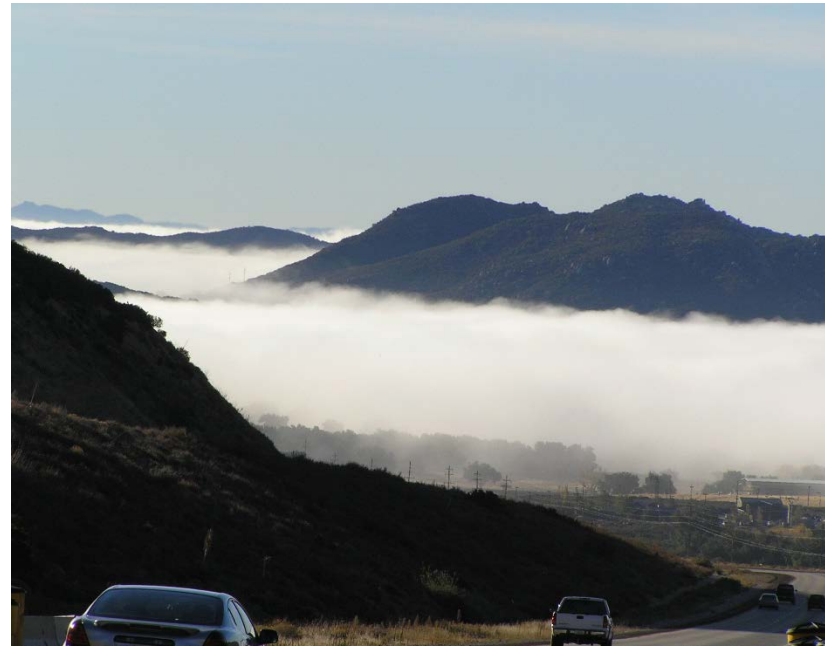
Campo above the clouds