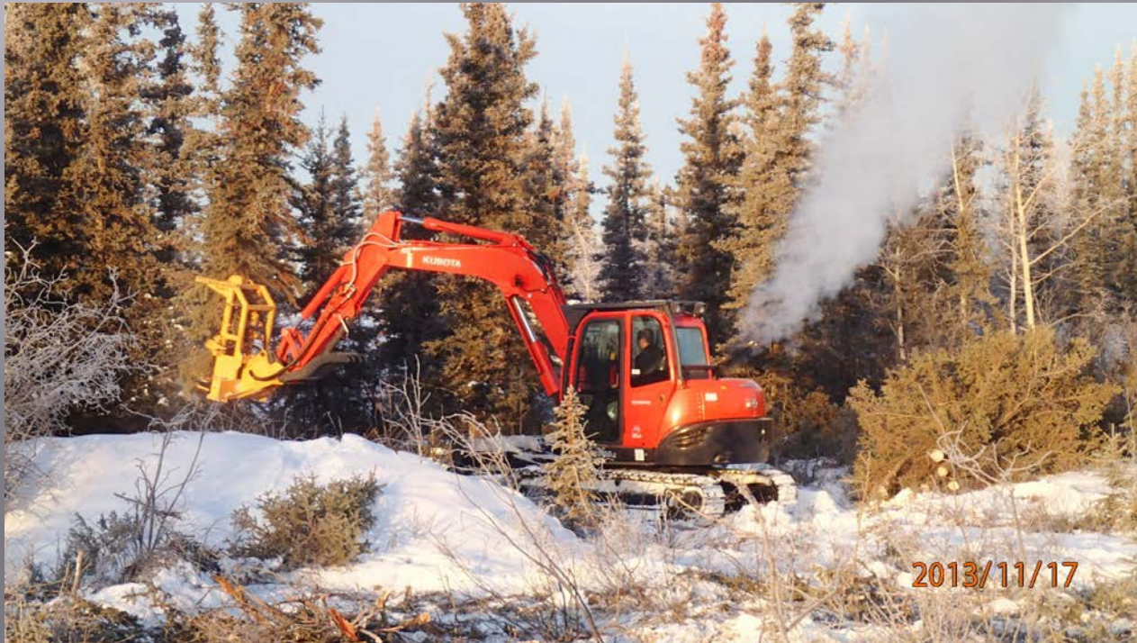
Fig 8: Kubota KX080-3 with Ryan's Equipment 12" Feller Bunching Shear