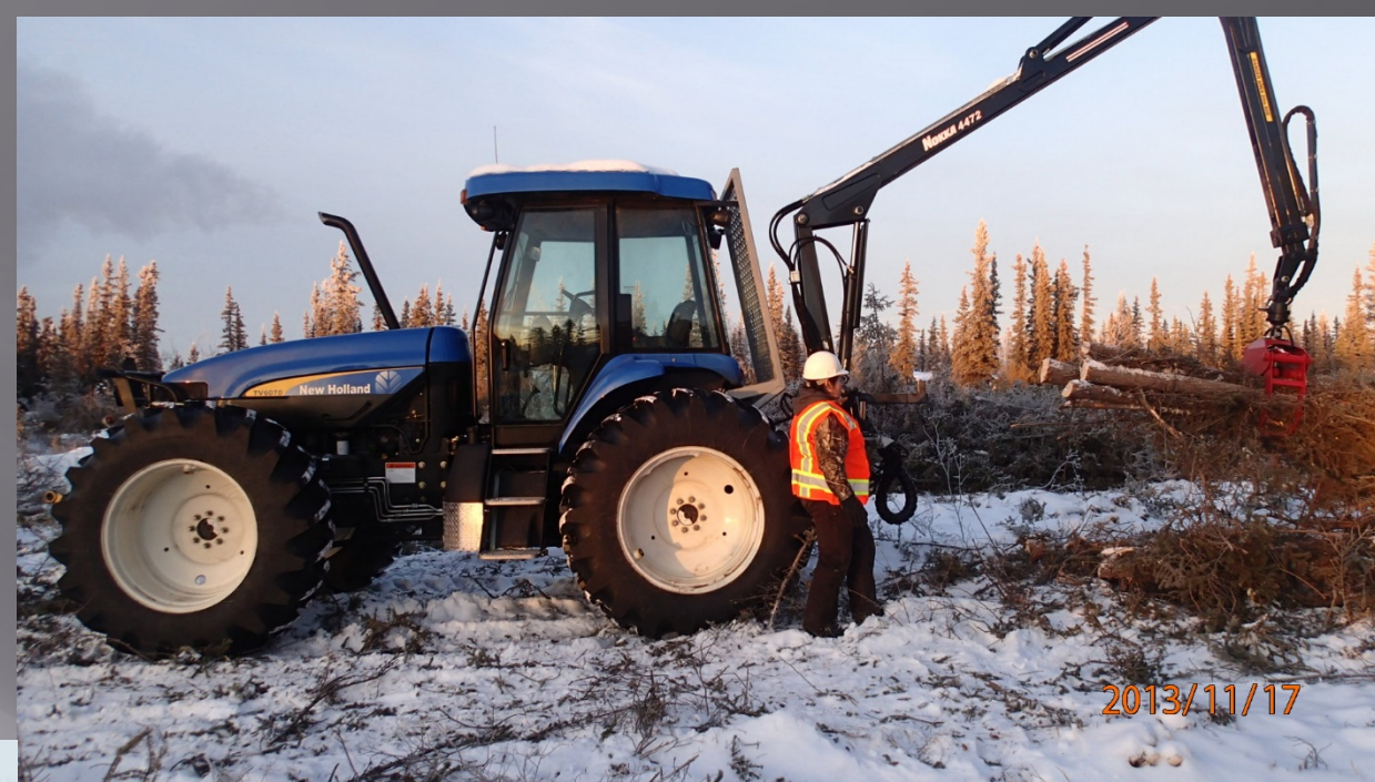
Fig 7: New Holland TV 6070 mounted with 3 point hitch Tractor Mounted Crane (Nokka 4472)