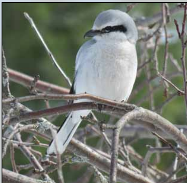
Northern Shrike.

Citizen empowerment and education is another conservation partnership focus of the Migratory Bird Program. The Urban Conservation Treaty for Migratory Birds is a grant program that empowers municipal governments and local partners to conserve birds that occur in U.S. cities by emphasizing education, habitat improvement, and threat reduction. One of our most successful education ventures to date is our partnership with Environment for the Americas and other non-profit organizations to sponsor International Migratory Bird Day (IMBD), which is the largest bird conservation-focused educational program in the Western Hemisphere. The 2012 IMBD Connecting People to Conservation campaign reached over 500,000 participants at 350 events. The success of these events and partnerships both advance bird conservation and inspire other partnerships to form, as well.