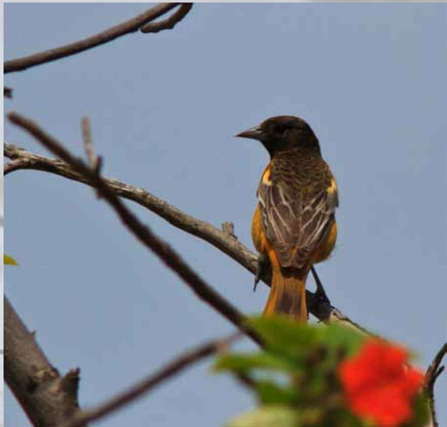
Baltimore Oriole.

To learn more about the Council and Council activities, please visit: http://www.fws.gov/migratorybirds/CCMB.htm