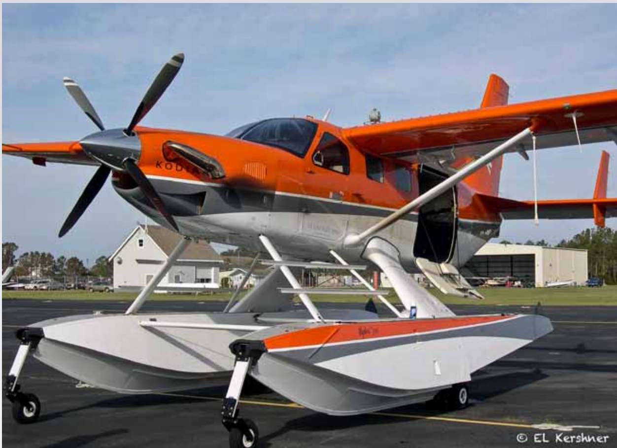
FWS Kodiak.

development interests to protect the marine environment while meeting the nation's energy demands.