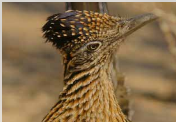
Marine Corps Base Camp Pendleton, CA protects coastal scrub habitat for Greater Roadrunners.

Military air fields use a variety of methods to reduce the potential for bird-aircraft collisions. Shown here: Falconry at Travis AFB in California. Photo Credit: Richard Fischer