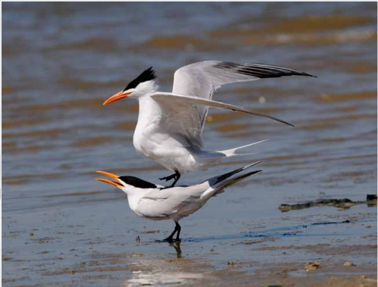
Royal Tern.