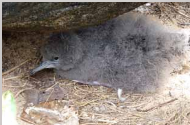
Marine Corps Base Hawaii-Kaneohe Bay and the Pacific Missile Range Facility support nesting Wedge-tailed Shearwaters.