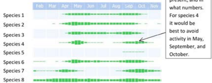
Figure 1. This seasonal distribution tool is found online, and informs agencies of when the fewest birds are present in their action area. The Avian Resources subcommittee provides access to this and other tools to assist agencies in their efforts to conserve migratory birds.

“The Avian Resources Subcommittee addresses the Council’s data management and decision-support needs.”