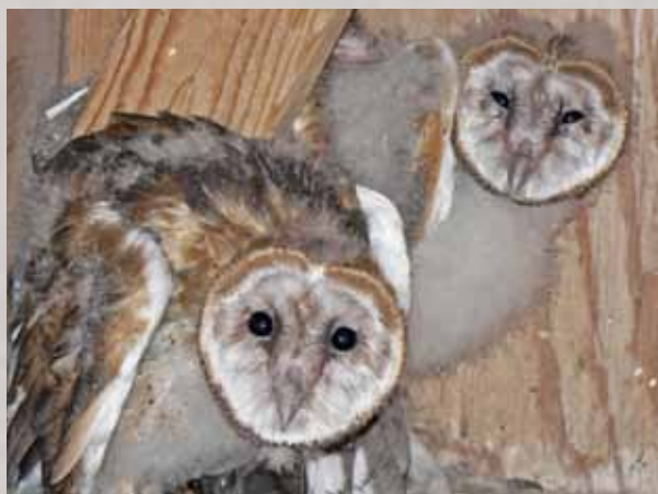
Recently hatched Barn Owls utilizing one of Sandia National Laboratories’ Barn Owl boxes.