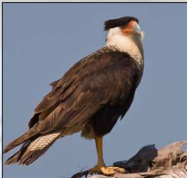
Crested Caracara.