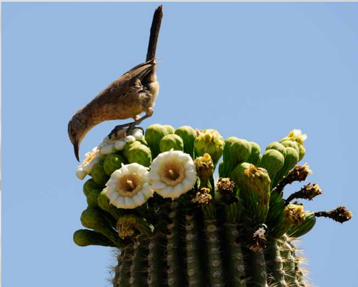
Curved-billed Thrasher.