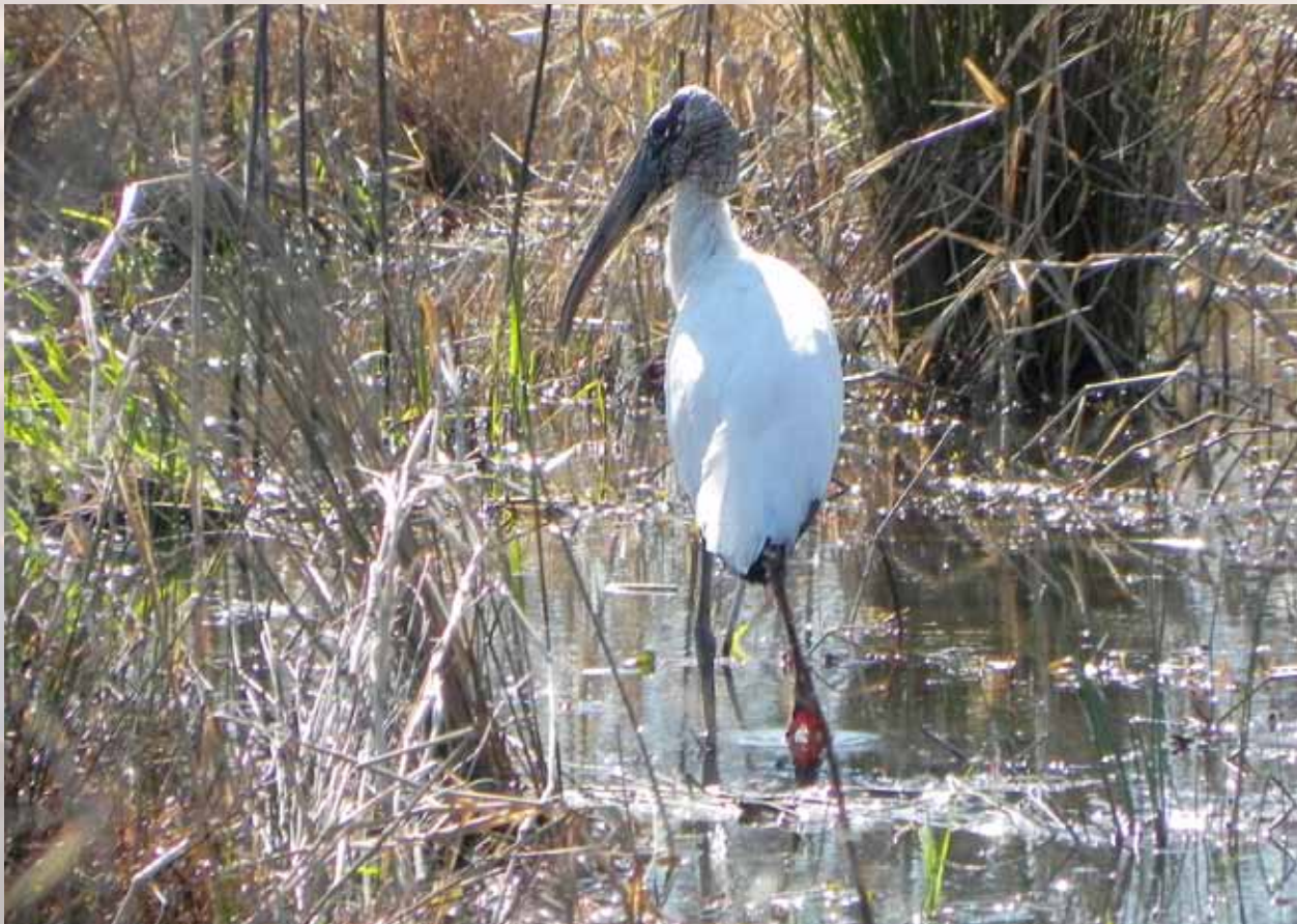
Federally endangered Wood Stork visiting a wetland in the MBHI project area of Tupelo Bend, Florida.

over 150,000 acres of critical bird habitat on private lands for targeted species including the Golden-winged Warbler, Greater Sage-grouse, Lesser Prairie-chicken and Southwestern Willow Flycatcher. NRCS and the FWS jointly prepared species recovery tools such as informal agreements, safe harbor agreements, and habitat conservation plans to provide regulatory certainty to landowners. WLFW enables farmers and ranchers to continue managing their lands while implementing conservation practices targeted to declining bird species.