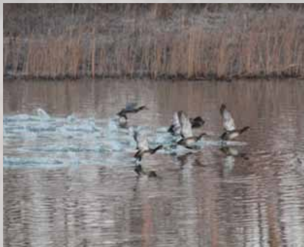
Redhead Ducks taking off from the former K65 Silos pond at DOE’s Fernald Preserve in Ohio. The habitat was developed during the Fernald Preserve cleanup in 2006 and further enhanced for wildlife use.

The Pantex Plant initiated surveys of plots for wintering and migrating raptors, as well as habitat types during the breeding season. This includes radio- and satellite-tracking of Swainson’s Hawks from local sites to their wintering grounds in South America.