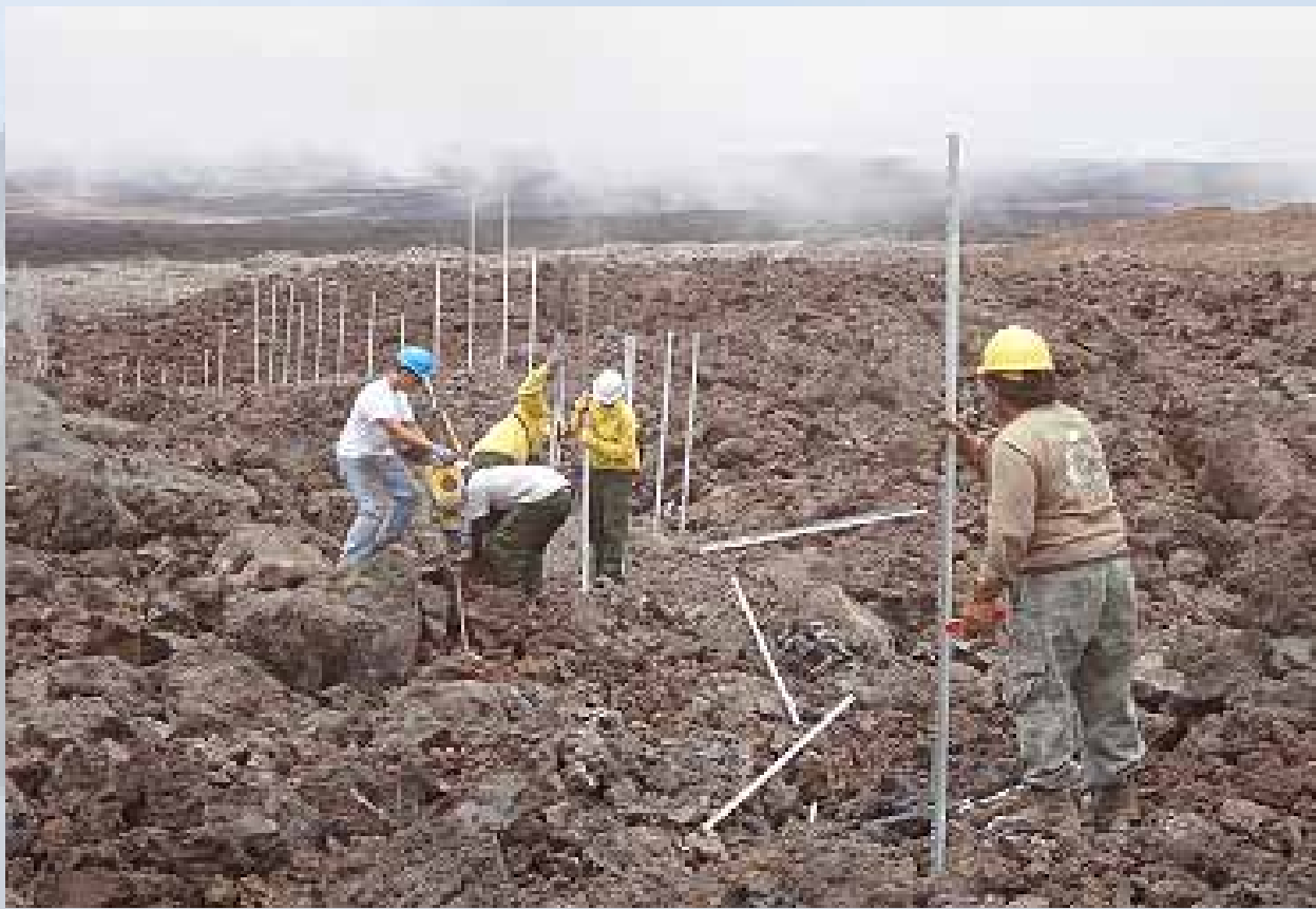
Predator fence construction at Hawai'i Volcano National Park.

primary threat to these ground-nesting birds. Live-trapping is inadequate to protect remote subcolonies, as cats return and depredate additional birds. The park had previously tested and implemented an effective cat-proof fence design for protection of the endangered Nēnē ( Branta sandvicensis ); and has evaluated and modified this design for high elevation sites to minimize potential adverse effects on low flying birds. The project was a collaborative effort funded by the NPS, FWS, American Bird Conservancy, and the Hawaiian Natural History Association.