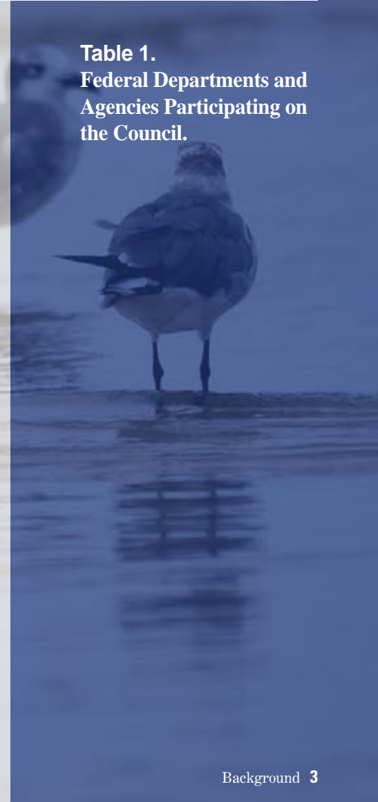
Table 1. Federal Departments and Agencies Participating on the Council.

The Council, which consists of 21 federal agencies (Table 1), meets annually and is chaired by the Director of the Fish and Wildlife Service. A Staff Committee exists to identify conservation opportunities that meet Council goals, and task-oriented subcommittees research issues and develop products required by the agencies to meet Council objectives.