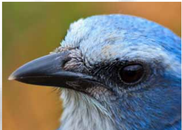
Florida Scrub-Jay.