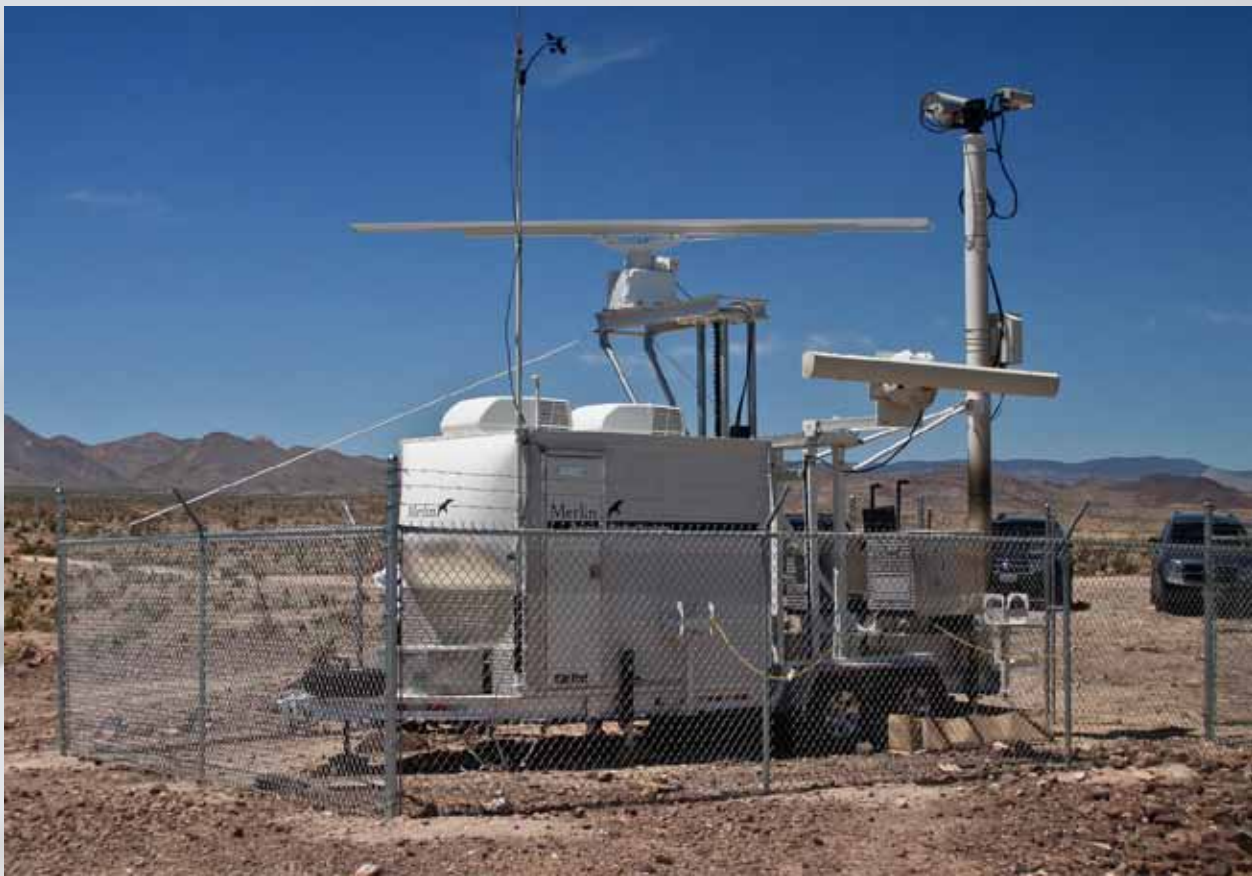
Merlin Radar System to track bird movements.

migratory birds. The research partnership between the FAA and USDA at the National Wildlife Research Center in Sandusky, Ohio is currently investigating avian visual perception and the efficacy of various light schemes on aircraft to reduce bird strikes. Preliminary data indicates pulsating lights can be detected more quickly by avian species than non-pulsating lights. Earlier detection provides more avoidance time and thus reduces strikes.