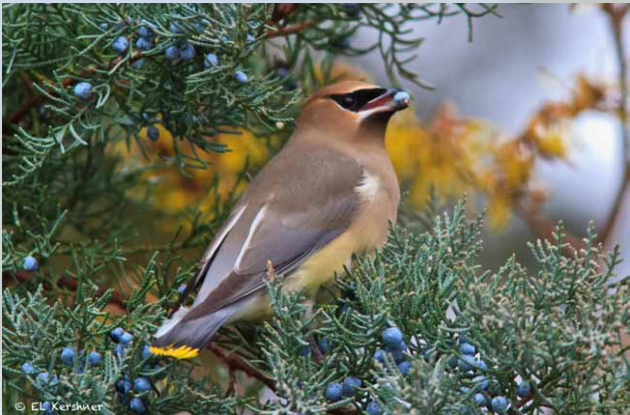
Cedar Waxwing.

distribution modeling of priority bird species on USFS lands to determine stewardship responsibility for conservation planning. This effort employs new predictive modeling techniques that are being developed at Cornell University. Cornell modelers will overlay land ownerships and interpolate the percentage of the total species abundance or distribution within each ownership category.