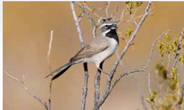
Black-Throated Sparrow.

The BLM is partnering with the Nevada Division of Wildlife, the Audubon Society, Nevada Conservation Corps, Student Conservation Association, Barrick Mine and Newmont Mine to rectify a threat to birds across the region. This partnership focuses on finding hollow mine markers and removing or capping them. Hollow mine markers are an entrapment hazard for many species of wildlife, including a significant number of birds that go into the marker but then get trapped and die. Since November 2011, the partners have knocked down more than 12,914 markers across more than one million acres in Nevada.