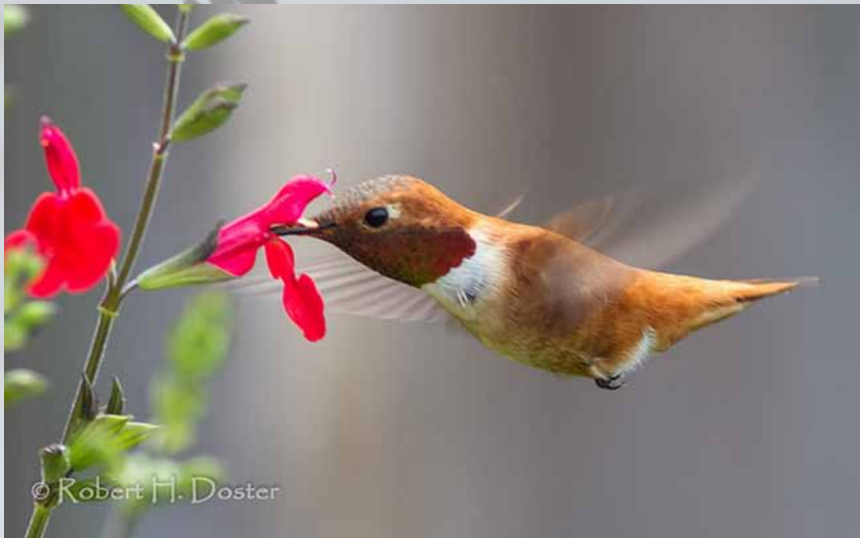
Rufous Hummingbird.

are largely developed in response to requirements of legislatively mandated laws such as the NEPA, and can be integrated into and implemented through agency plans and guidance. In 2012, the Subcommittee amassed a repository of easily implementable and effective bird conservation practices. This Subcommittee manages that comprehensive list of conservation measures, and mines it for relevant practices that can be used by federal agencies to reduce impacts to migratory birds. The Subcommittee is partnering with the Avian Resources Subcommittee to remotely deliver conservation measures online through a FWS tool; the Subcommittee is also looking across Council agencies to identify the best information and delivery mechanisms to ensure this information is easily available to Council agency personnel.