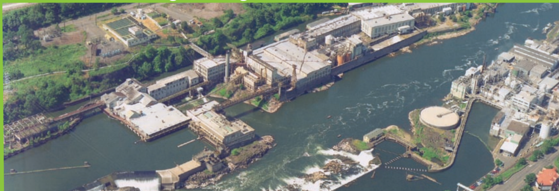
Steam is used to dry paper and power two papermaking machines at the West Linn Paper Company's mill in West Linn, Oregon, which produces nearly 700 tons daily of coated paper.