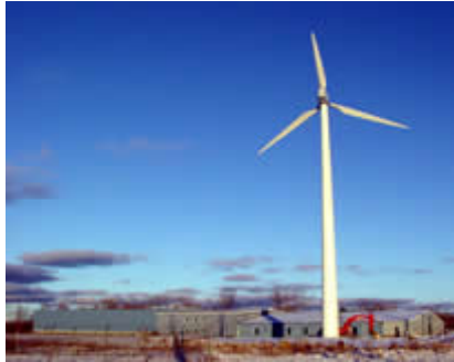
Harbec Plastics in Ontario, NY