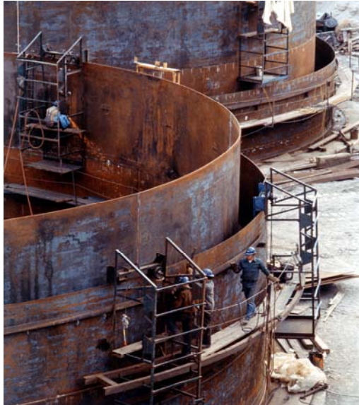
Cleanup of waste tanks at the Hanford Site

While these corrective actions are positive, recent OIG reviews have identified additional improvements that are necessary to ensure that the Department's efforts to implement project management principles are effective. For example, in one of the largest and most important of its environmental remediation projects, the Department is constructing a Waste Treatment Plant at the Hanford Site. The $12.2 billion facility is designed to treat and prepare for disposal of 53 million gallons of radioactive and chemically hazardous waste. Given its classification as a Category II nuclear facility, the Waste Treatment Plant must meet quality assurance standards for nuclear facilities, which significantly exceed those required for commercial facilities. As a result, the design called for the installation of a computerized integrated control network to monitor the operation of a number of key processes of the Plant.