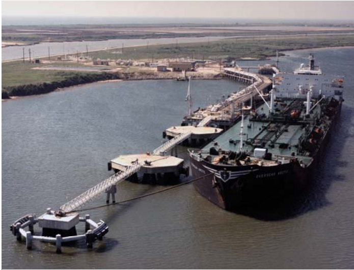
A barge docked at Phillips Terminal at the Strategic Petroleum Reserve

In order to evaluate these concerns, we conducted a review to determine whether the Department had analyzed all relevant data in selecting a site location for the expansion of the Reserve. Our review found that the Department and its contractor had in fact analyzed all available well and seismic data related to the Bruinsburg site and augmented this information with additional seismic tests. Additionally, we found that there are inherent uncertainties involved in the process of estimating the size of salt domes. As a consequence, the exact size and shape of the Bruinsburg salt dome is not fully known. Overall, we determined that the Department took the