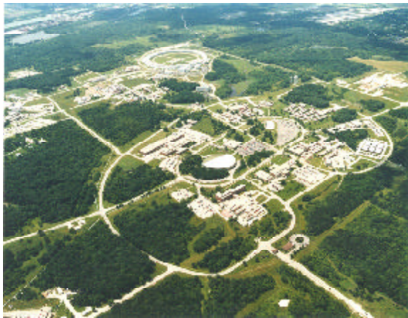
Aerial View of ANL

The U.S. Department of Energy (DOE) Office of Independent Oversight and Performance Assurance (OA) inspected environment, safety, and health (ES&H) programs at the DOE Argonne National Laboratory (ANL) during April and May 2005. The inspection was performed by the OA Office of Environment, Safety and Health Evaluations. OA reports to the Director of the Office of Security and Safety Performance Assurance, who reports directly to the Secretary of Energy.