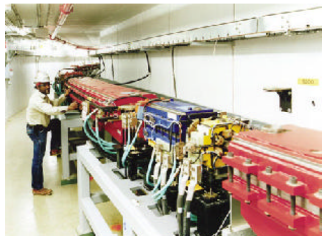
APS Boosters Synchrotron

ASO provides effective direction to and oversight of ANL for the development and implementation of an EMS, and ASO has driven enhanced performance by ANL in achieving EMS milestones by using performance measures specific to these milestones.