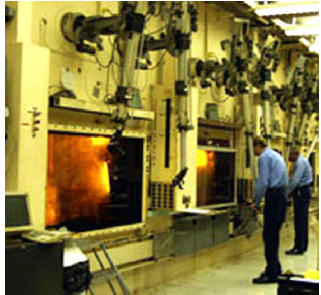
Alpha-Gamma Hot Cell Facility

on areas where performance in 2002 was not sufficiently effective, such as in non-experimental work, nuclear safety systems, radiation protection, and feedback and improvement.