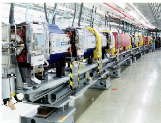
APS Storage Ring Sector

Implementation of ES&H requirements and work control processes at the activity level has not been effective for some non-experimental work activities. Some improvements have been made in all of the organizations reviewed, including establishment of work control and hazards analysis processes. However, these efforts have not been