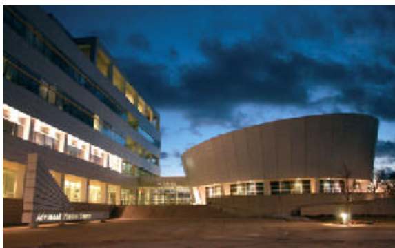
APS Main Entrance

The manual is effective in identifying regulatory requirements applicable to ANL and providing specific and useful information for ANL personnel. For example, the ES&H Manual section on chemical carcinogens provides a composite listing of applicable carcinogens, thereby eliminating the need for workers and line managers to independently analyze a variety of listings of known, suspect, and likely carcinogens, and arriving at conclusions that are often inconsistent. In addition, the ES&H Manual includes guidance for implementing some industry good practices that are not mandated by regulations. For example, although a written safety program for lead is not required by the Occupational Safety and Health Administration (OSHA), ANL has recently incorporated requirements and guidance for lead usage and surface contamination levels within the ES&H Manual.