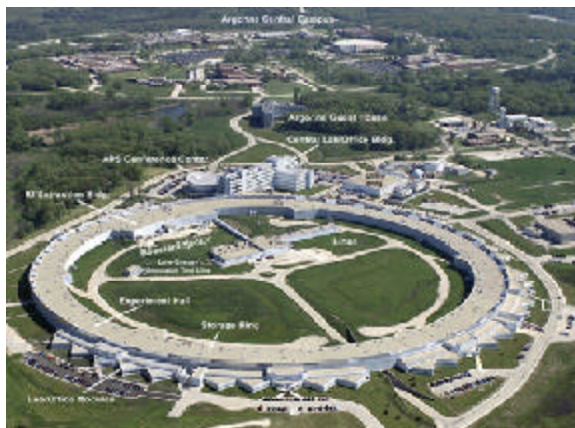
Aerial View of APS

The first four core functions of ISM are implemented with varying levels of effectiveness for non-experimental work by the various line organizations reviewed. ANL personnel are typically very experienced, and many work activities are performed with a high regard for safety. Some hazards are adequately analyzed and controlled. However, there are deficiencies in work planning and control in all organizations reviewed. Further, there are deficiencies in some institutional safety requirements that impact the effectiveness of ES&H programs at the facility and activity level. As a result, in addition to the deficiencies discussed below in individual ANL organizations, some ES&H requirements have not been implemented, some medical surveillance activities have not been performed, and there are deficiencies in some aspects of radiation protection at the activities reviewed.