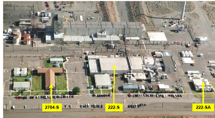
Buildings identified above are used by small business and shared with Tank Operations Contractor.