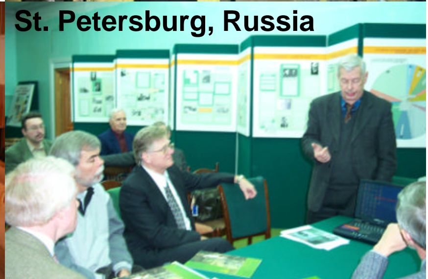
St. Petersburg, Russia