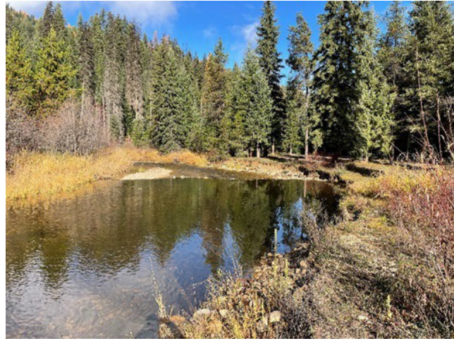
Figure 1. Rock dam at campground constructed by the public. Sediment build-up behind the dam prevents it from washing out each spring and is a barrier for juvenile fish. The photo on the right shows the eroded bank at the campground. A log jam was originally proposed to be constructed along that bank.

Installation of the rock weir would include constructing the weir using large boulders, sized to withstand high spring flows. Footer boulders would be partially buried in the channel and banks, with a second layer of boulders keyed in on top of the footer boulders. The weir would create a pool upstream of the weir. A low notch in the center of the weir would concentrate the river thalweg in the middle of the river. Installation would occur in two sections, and disturb approximately 2,500 linear feet (1,250 feet on each side of the river) of streambank. The work area on one side of the river would be isolated using cofferdams (bladder coffer if bulk bags are not effective) placed using an excavator operating from the streambank. Cofferdams would be removed and the work area slowly rewatered. After rewatering, the second half of the construction site on the opposite stream bank would be isolated using a cofferdam, the remainder of the weir constructed, the cofferdam removed, and the site slowly rewatered.