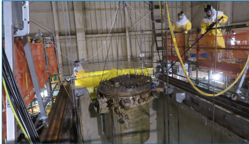
Removing the reactor vessel from the Oak Ridge Research Reactor

OREM is slated to remove more than 200 facilities at ORNL. More than 30 of those structures are considered high-risk buildings due to structural, radiological, or chemical hazards. Major cleanup is already underway. Crews have taken down two former reactor facilities in recent years, and they are busy preparing nearly a dozen other reactor facilities and isotope labs for near-term demolition.