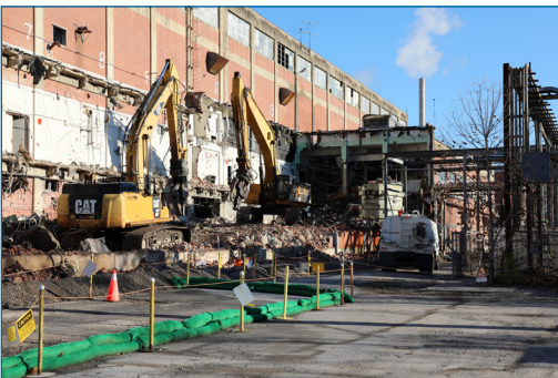
Demolition underway on Alpha-2 at Y-12

Our cleanup is enabling that transformation from old to new. We anticipate removing nearly 80 facilities at Y-12 in the decades ahead. Of