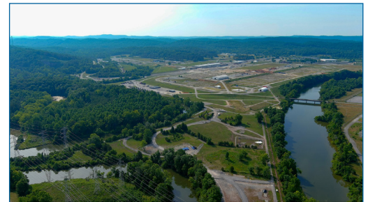
East Tennessee Technology Park

The site was renamed the East Tennessee Technology Park in 1997. Along with cleanup, OREM pursued a vision to transform the site from a liability into a multi-use industrial center, national park, and conservation area that benefits the community and creates new economic opportunities. In 2020, OREM completed DOE's largest-ever cleanup effort when it finished taking down 500 structures at the site. Together, those facilities had a footprint that could cover 225 football fields. The final phases of cleanup involve soil and groundwater remediation. Crews finished soil remediation in 2024, and OREM is working to complete any needed groundwater remediation in the years ahead.