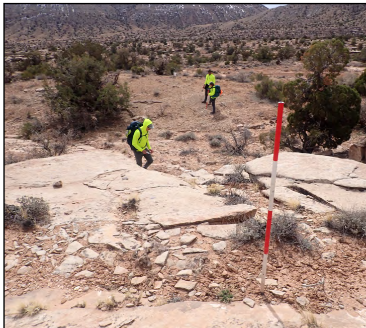
V&V work on the Navajo Nation, November 2022.

DRUM field teams consist of five people traveling in multiple vehicles with U.S. government-issued license plates. Fieldwork activity details are below.