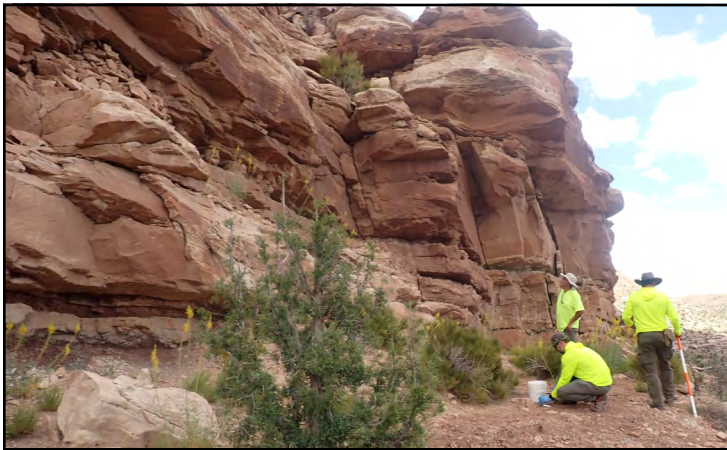
DRUM field team members look at mine features and collect soil samples for testing.

Work will continue through 2025 and could extend after.