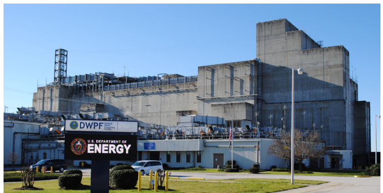
DWPF began radioactive operations in March 1996.

Scientists have long considered vitrification as the preferred option for treating radioactive liquid waste. By immobilizing the radioactivity in glass, DWPF reduces the risks associated with the continued storage of liquid waste at SRS and prepares the waste for final disposal in a federal repository.