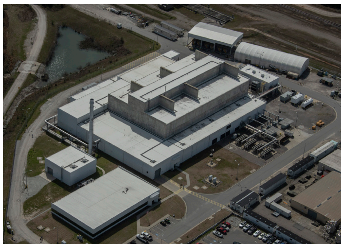
SWPF will process the majority of the Site’s salt solution waste.

Removing salt waste, which makes up approximately 92 percent of the waste volume in the SRS tank farms, is a major step toward emptying and closing the Site’s remaining 43 high-level waste tanks that contain approximately 34.5 million gallons of waste.