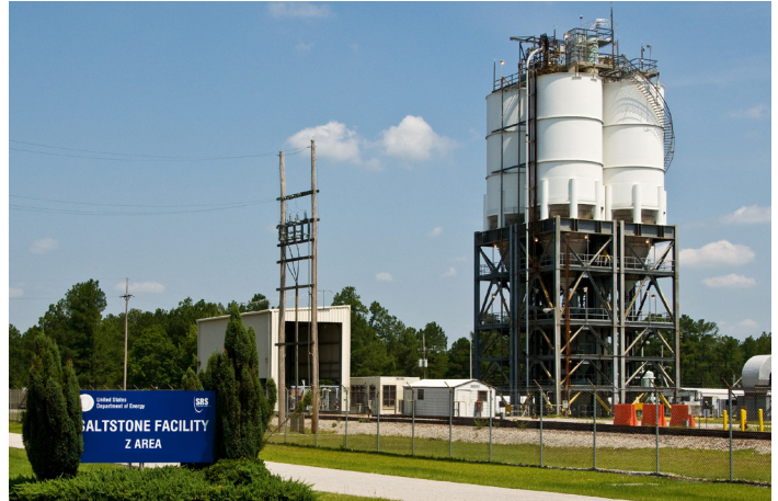
SPF contains the tanks and equipment necessary to process saltstone grout.

SDUs are large concrete vaults used for permanent disposal of the saltstone. The early vaults were rectangular in shape. Subsequent SDUs were cylindrical and based on a design used commercially for storage of water and other liquids. The early cylindrical SDUs held approximately three million gallons of saltstone. In 2012 DOE approved the design for mega-volume units that are 10 times larger than the previous SDUs. The mega-volume units are 375 feet in diameter, 43 feet high, and can hold approximately 33 million gallons of saltstone. They are designed for the larger quantities of DSS produced by SWPF.