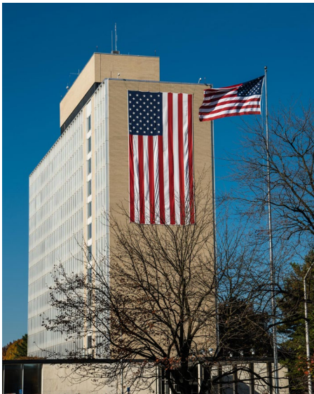
Figure 2. The NIST administration building is undergoing renovation to add new technologies.