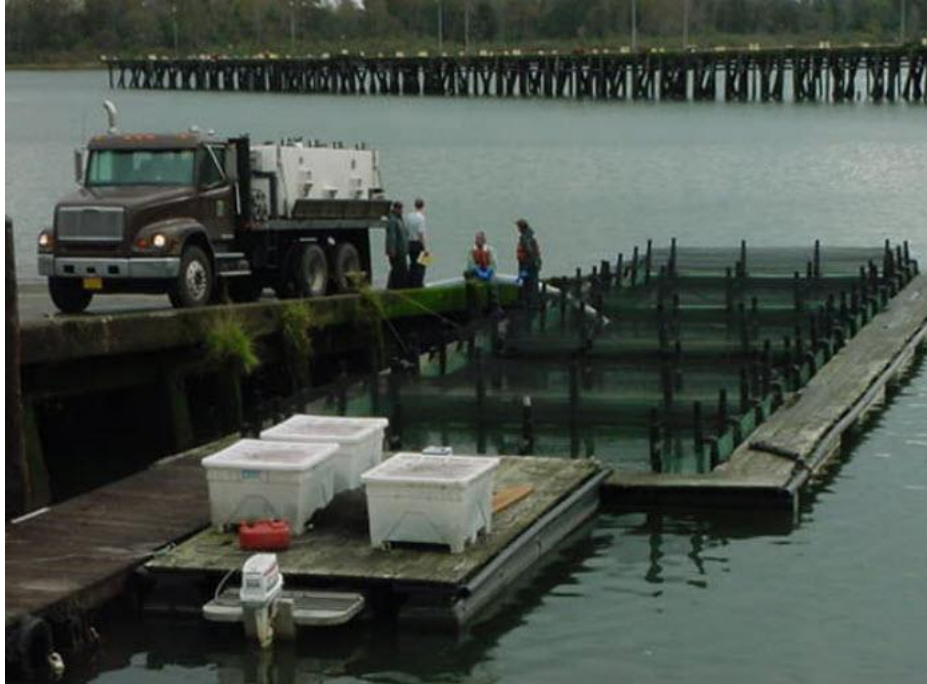
Figure 11: Transferring Juveniles into Net Pens