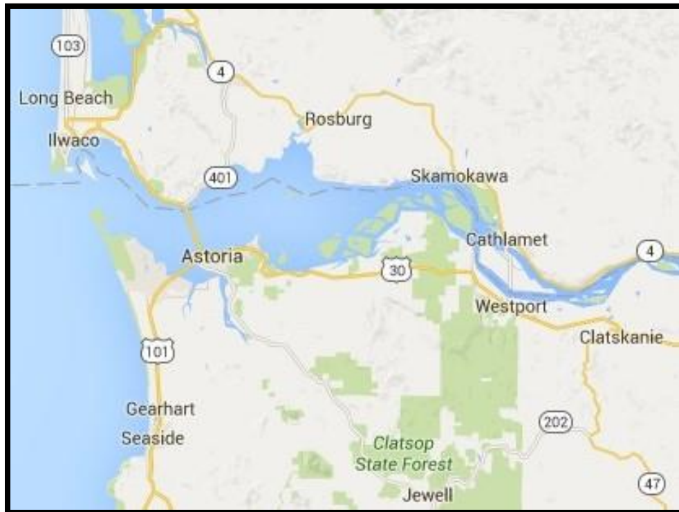
Figure 12: Communities near the SAFE Facilities

Table 6 displays the population characteristics of the counties within the estuary. Clatsop and Pacific counties are the counties most likely to see the majority of the economic benefits from commercial and recreational fisheries resulting from the SAFE Program. Economic data from Clatsop County will be used predominantly in this analysis.