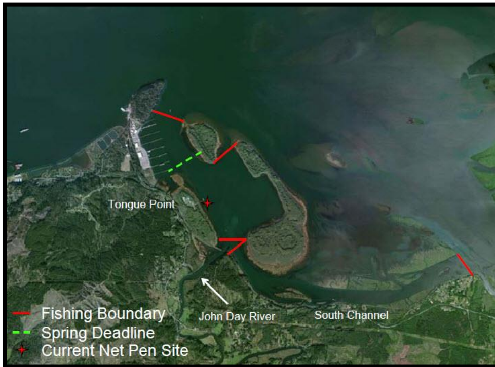
Figure 4: Tongue Point Net Pen Site and Select Area Fishery

Tongue Point Basin is located just east of Astoria, Oregon, in the concurrent Columbia River waters bounded by the Oregon shore and Mott and Lois islands (see Figure 4 and Figure 5) at RM 20 on the Columbia River Estuary Watershed. The terminal fishing area includes waters of South Channel. All waters at this site are under concurrent state jurisdiction. There are currently 37 net pen structures used for rearing and release. The number of net pens would vary (+/- 10 pens) depending on desired density, acclimation and release schedules, and production goals.