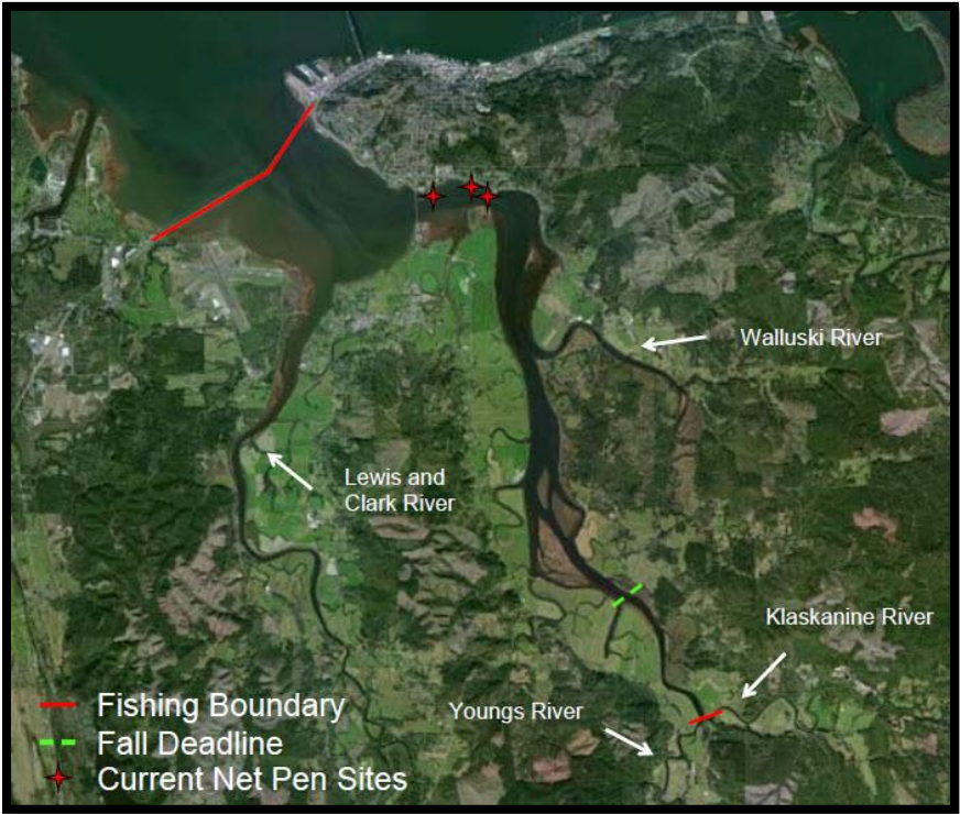
Figure 3: Aerial View of Youngs Bay Net Pen Sites