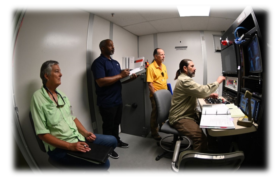
NSSAB members observed the Radioactive Waste Acceptance Program performing the real-time radiography of waste packages at the NNSS – May 2024