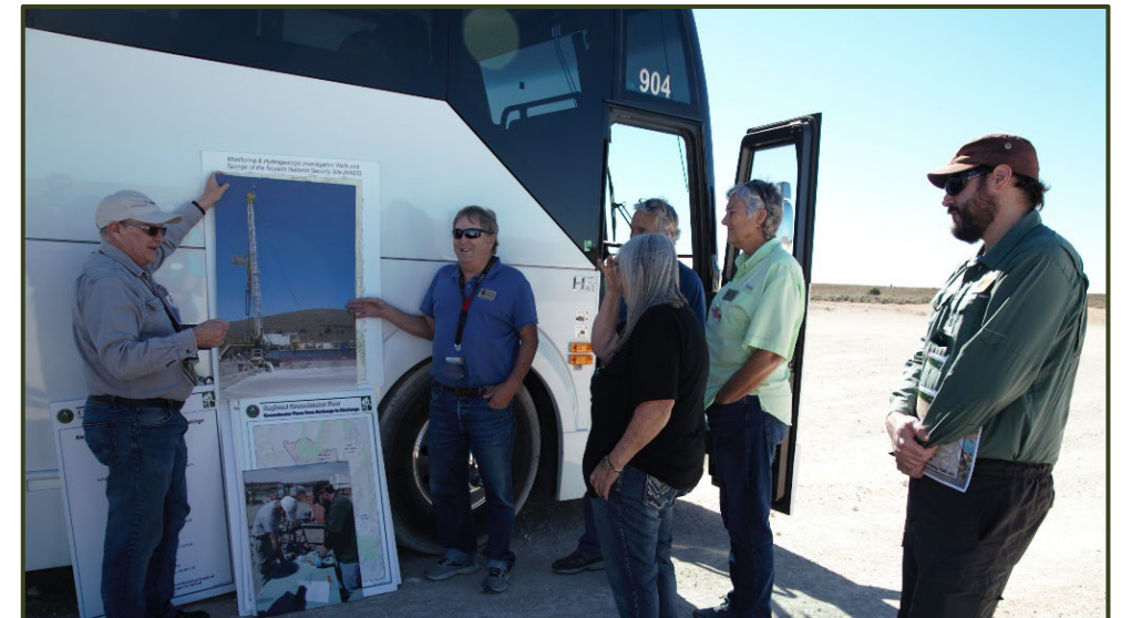
NSSAB provided a view of well drill site – October 2023