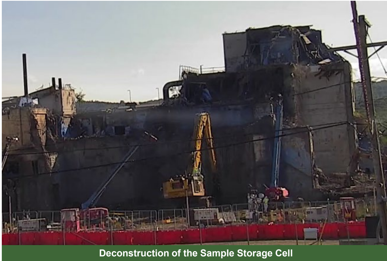
Deconstruction of the Sample Storage Cell