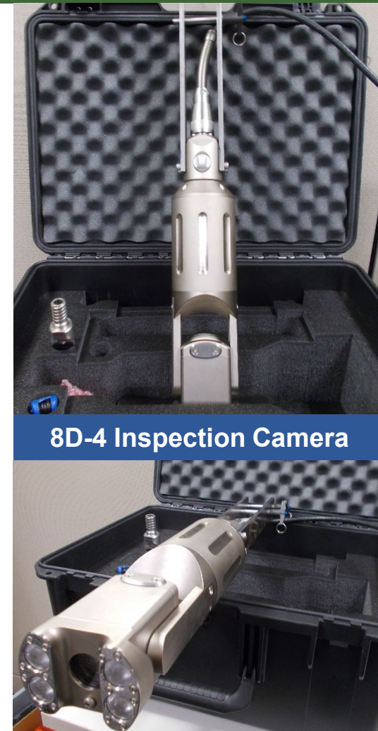
8D-4 Inspection Camera