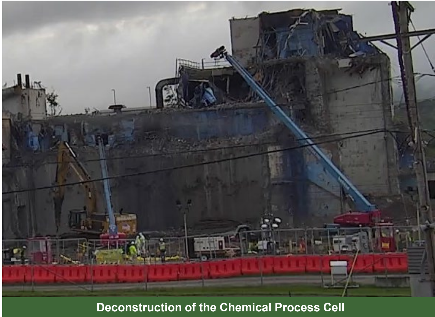
Deconstruction of the Chemical Process Cell