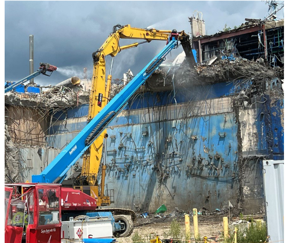
Chemical Process Cell Upper East Wall Removal