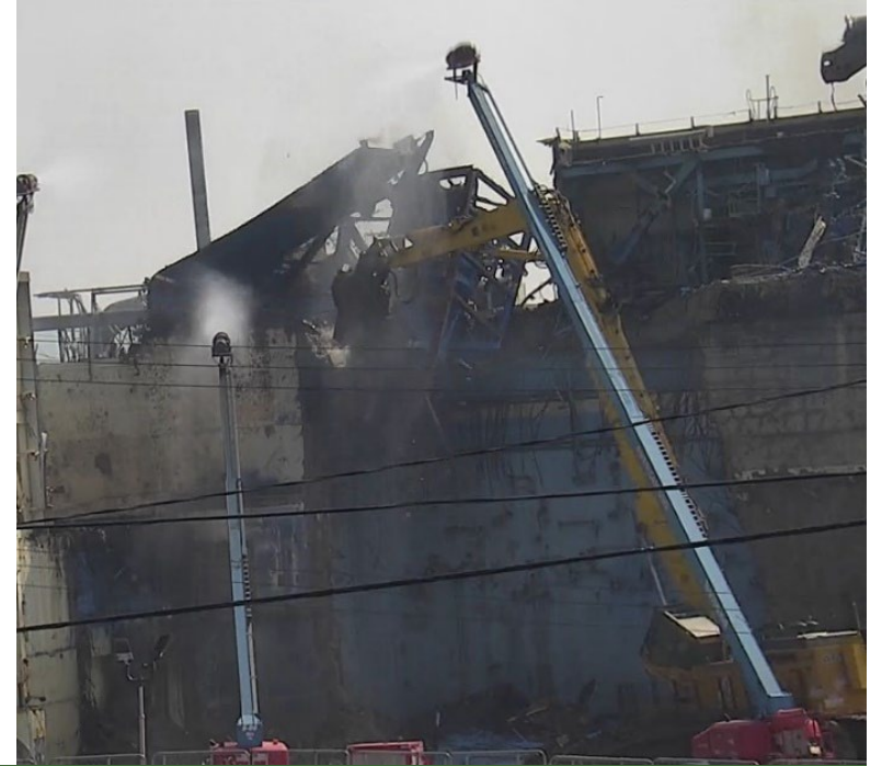
Deconstruction of the Chemical Process Cell Penthouse Enclosure