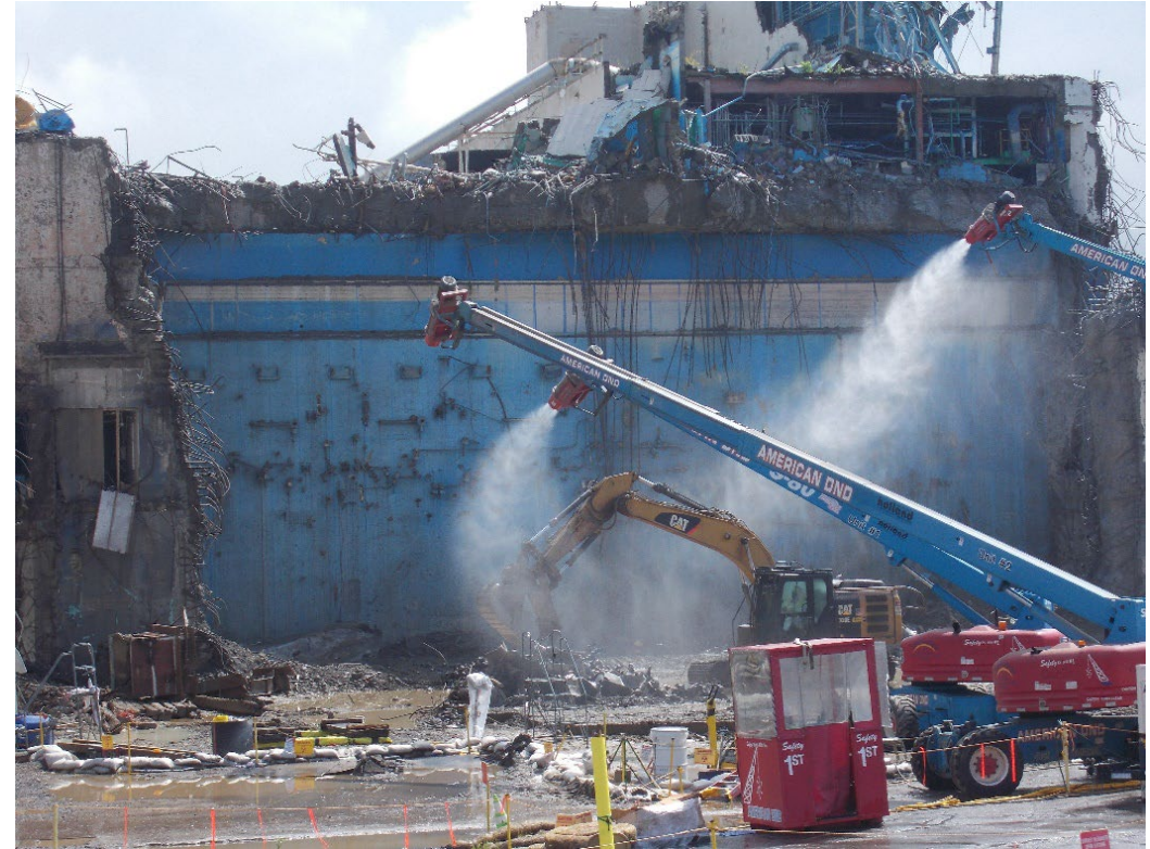
Waste Loadout of Demolition Debris