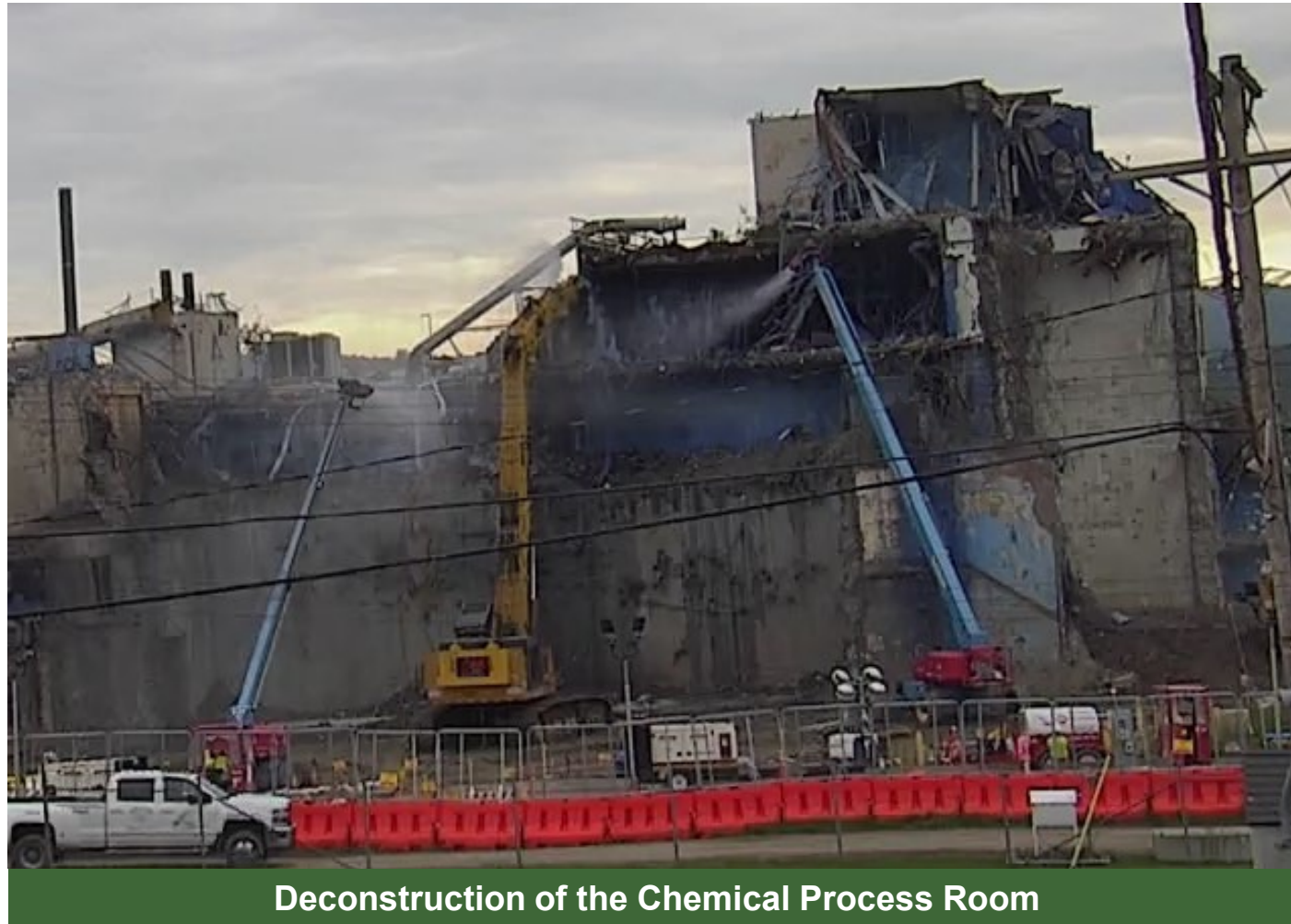
Deconstruction of the Chemical Process Room