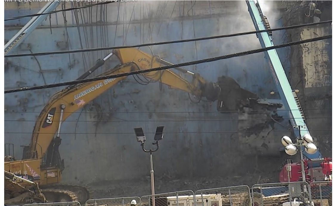
Chemical Process Cell Storage Rack Final Removal and Size-Reduction of Ventilation Stack