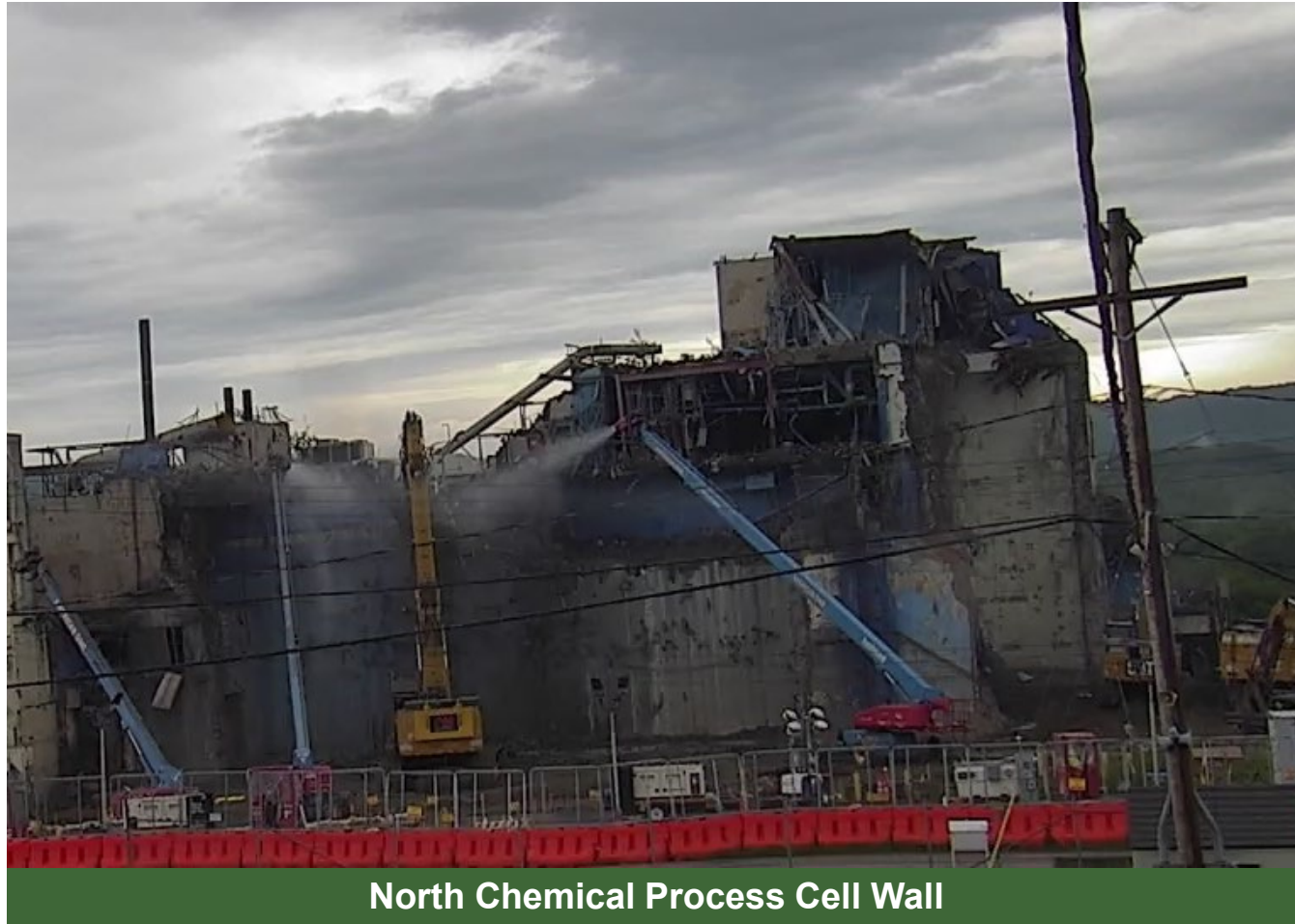
North Chemical Process Cell Wall