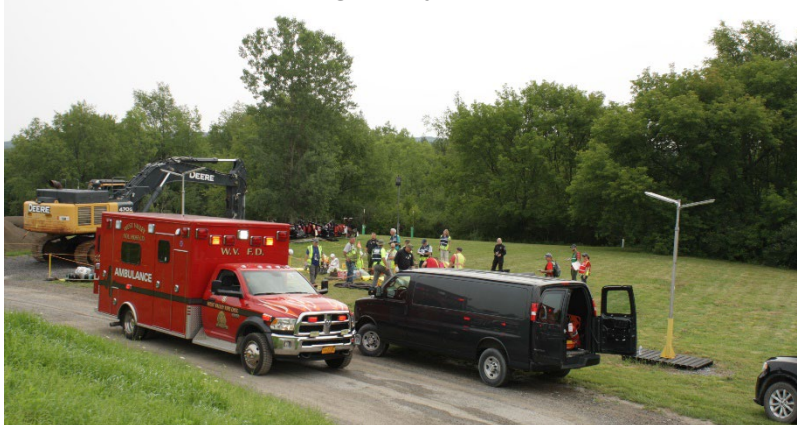
Simulated Emergency Exercise Scene