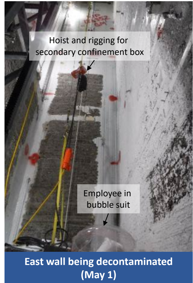
East wall being decontaminated (May 1)