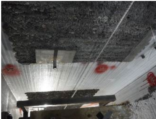
Wall inside PPC-S after aggressive decontamination (May 1)