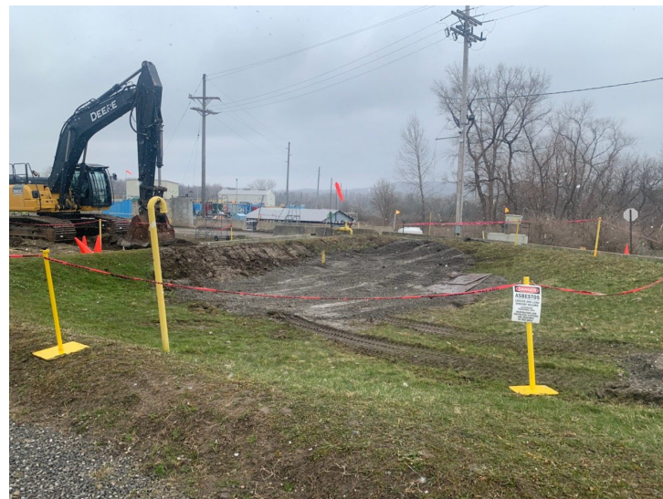
Utility Room Diesel Tank Removal