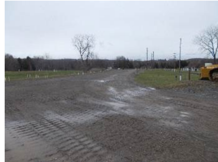
Graded area for topsoil and seeding in the Spring (April 2022)