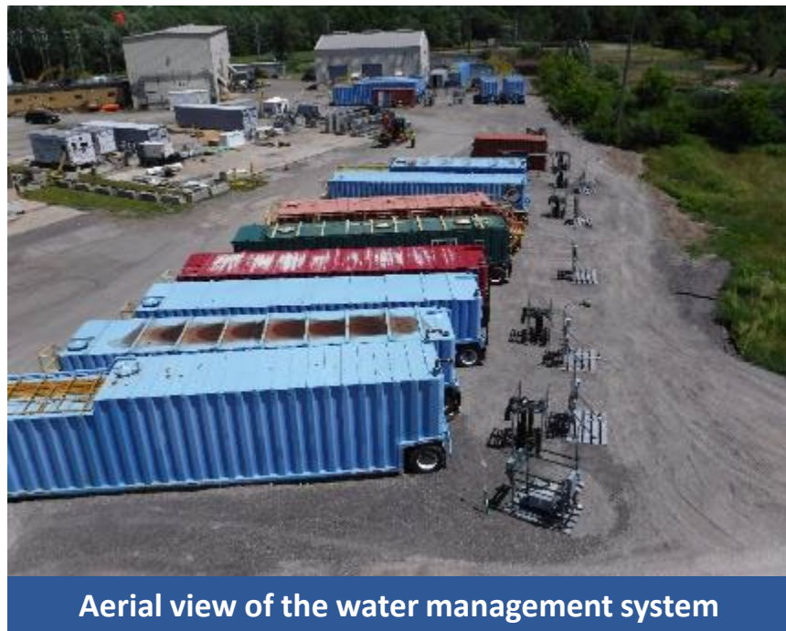
Aerial view of the water management system