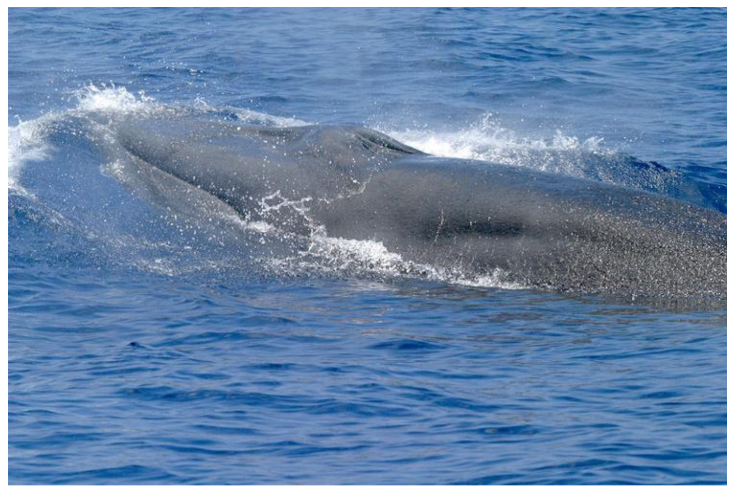
Rice's Whale.

Rice's whales are members of the baleen whale family Balaenopteridae. With likely fewer than 100 individuals remaining, Rice's whales are one of the most endangered whales in the world. Recovery of the species depends upon the protection of each remaining whale.