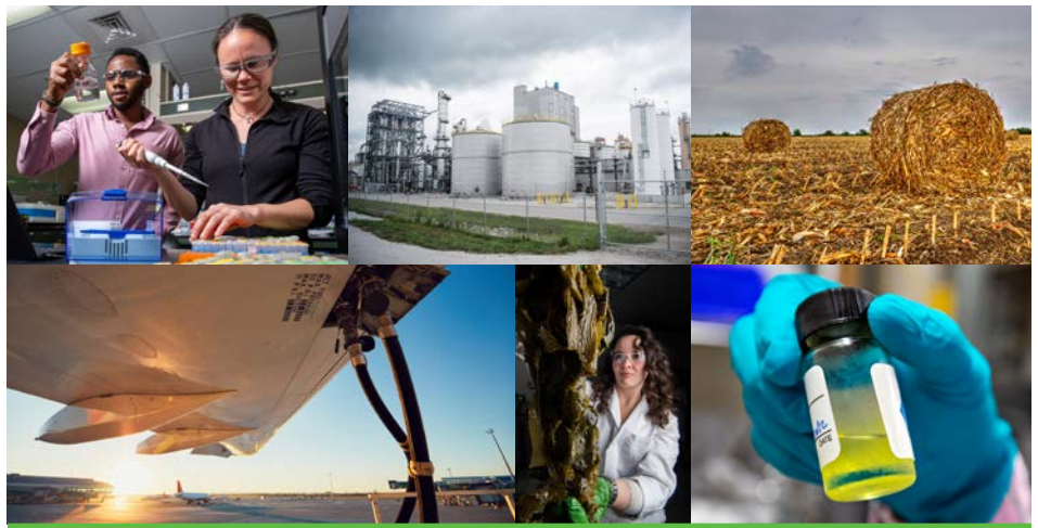
BETO's programs span the full bioenergy value chain—providing insights on resource harvesting, preprocessing, conversion, and transformation into sustainable high-performance fuels and products.

The United States has a wealth of sustainable biomass and waste resources capable of supporting a robust bioeconomy. Every year, these renewable carbon resources can be leveraged to produce 50 billion gallons of low-carbon biofuels for aviation, ships, and heavy-duty vehicles; 75 billion kilowatt-hours of renewable electricity; and 17 billion pounds of bio-based commodities and products. 1