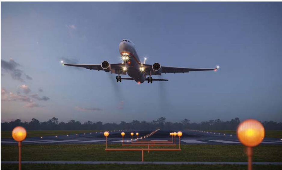
Low-carbon biofuels like sustainable aviation fuel are essential in efforts to decarbonize key sectors of the U.S. economy.

BETO's conversion program supports RD&D on technologies for converting biomass feedstocks into finished liquid transportation fuels such as renewable gasoline, renewable diesel, and sustainable aviation fuel. BETO is exploring a variety of conversion technologies that can be combined into pathways, from feedstock to product. BETO funds projects that target barriers in critical conversion process steps—with a goal of empowering companies with data and experimentally verified technologies.