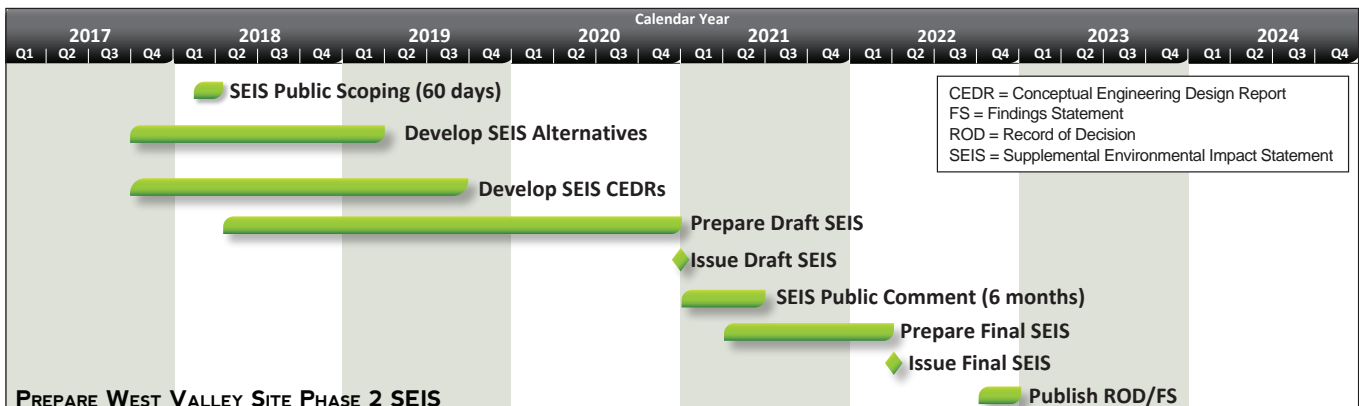
PREPARE WEST VALLEY SITE PHASE 2 SEIS

The tentative schedule for the SEIS for the West Valley Site is shown in the timeline below. It includes two main opportunities for public involvement: the 60-day public scoping period (currently taking place) and a 6-month comment period on the Draft SEIS.