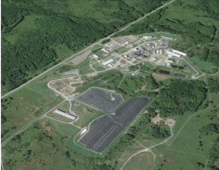
The West Valley Demonstration Project and the State-Licensed Disposal Area