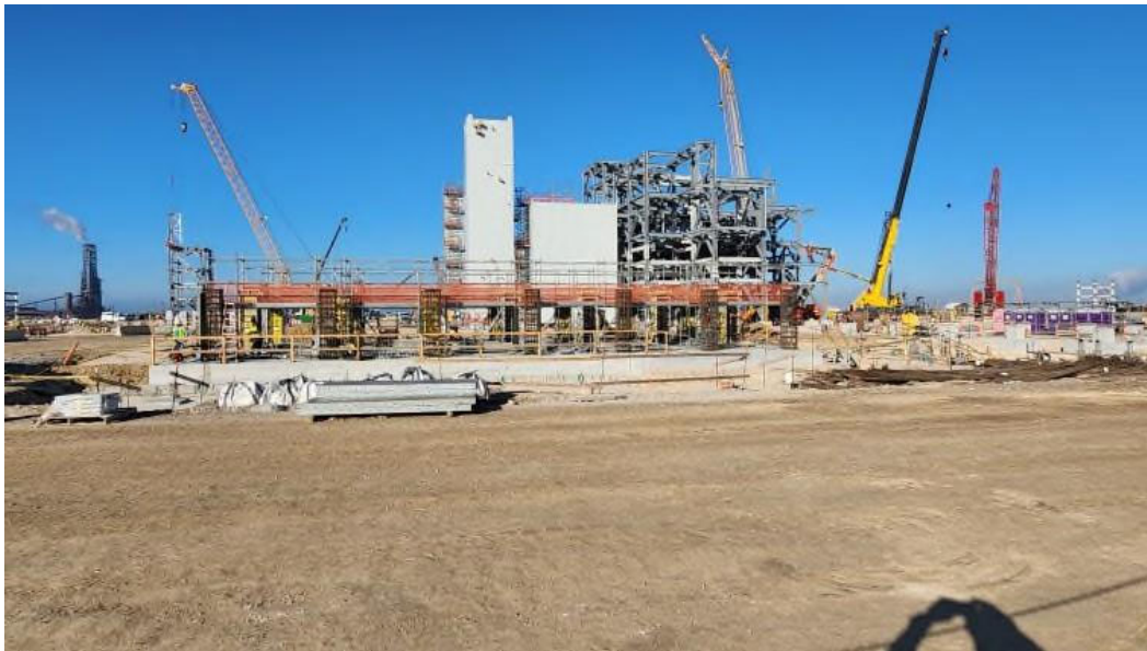
Photo 6: Area 311N01 Pedestal Preparation for the Liquefaction Substation (Train 1)