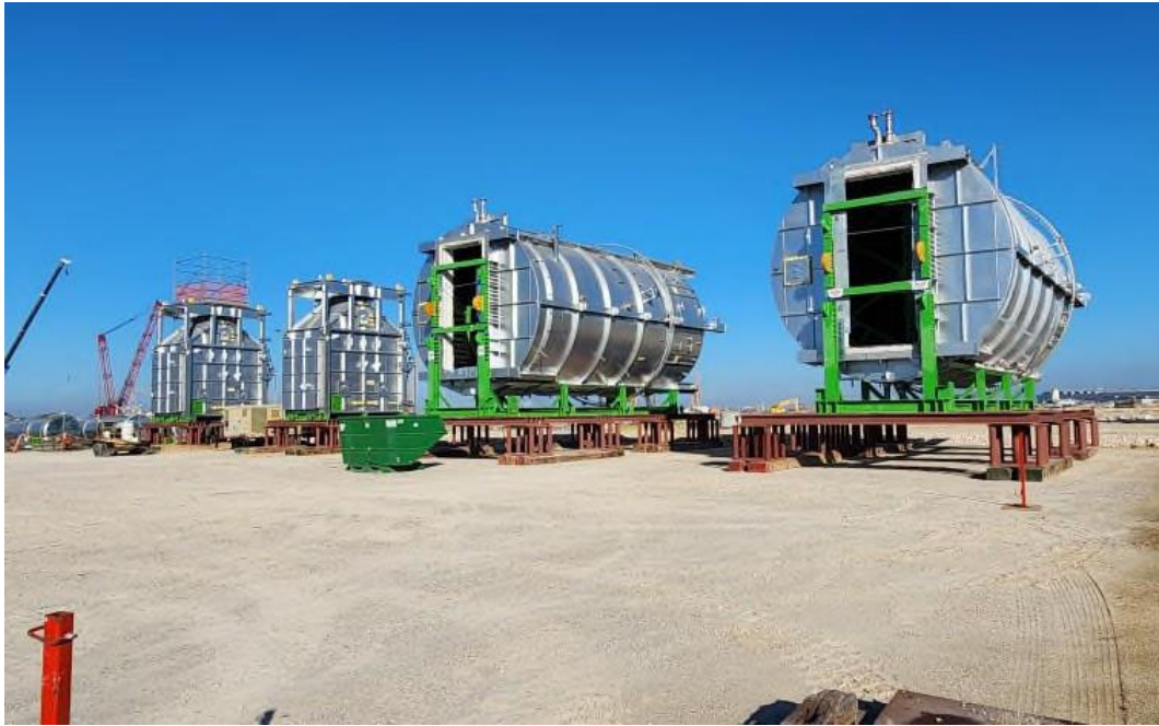
Photo 5: Staging Sections of the Trains 1 & 2 Hot Oil Furnaces (Laydown Yard)