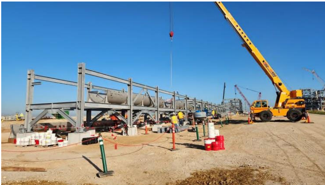
Photo 4: Area 310R18 Steel Erection – Including Pipe Trough (OSBL South)