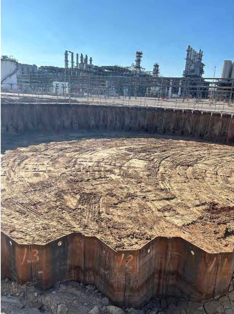
Photo 5: Area 310Q02 Transfer Line Spill Impoundment Basin Excavation