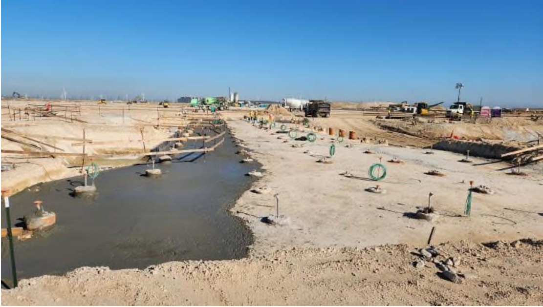
Photo 1: Area 310D01 Mudmat placement for the GIS Substation (OSBL East)