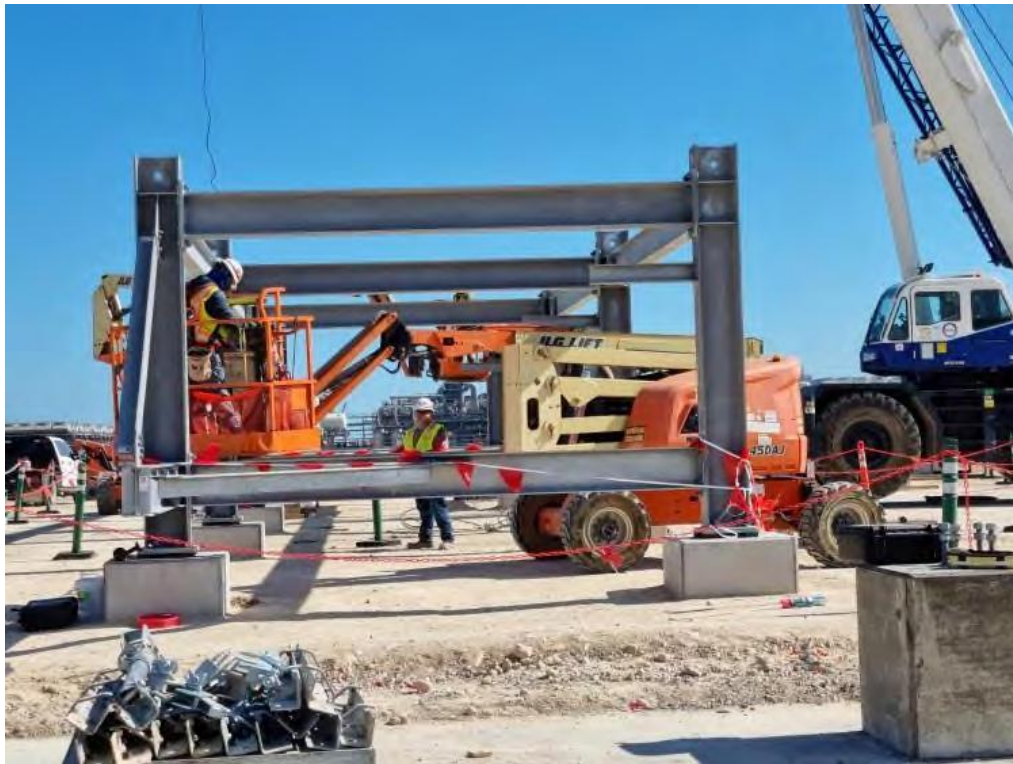
Photo 2: Area 310R18 LNG Transfer Pipe Rack – Steel Erections (OSBL South)