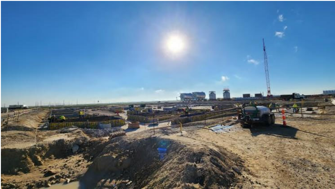
Photo 2: Area 310M01 Formwork & Rebar for Ground Flare 1 (OSBL East)