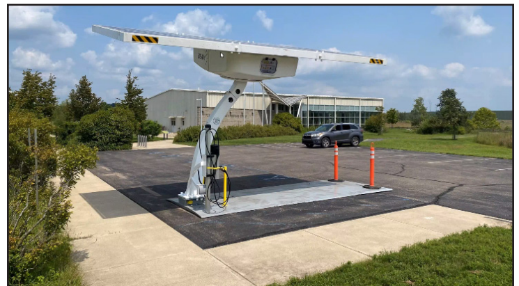
LM has installed multiple solar-powered electric vehicle charging stations like the one seen here at the Fernald, Ohio, Site.