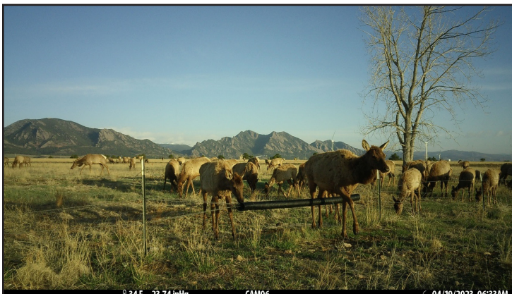
Ecologists installed game cameras at the Rocky Flats, Colorado, Site to capture the elk using the wildlife corridor located on site.

LM's conservation reuse includes activities supporting natural resource protection, habitat development and enhancement, and wildlife management options at LM sites. Conservation reuse includes areas where a proactive measure has been implemented to create, restore, protect, or enhance a habitat. Currently, LM manages a number of sites that have various conservation reuses such as protection of endangered or listed species (e.g., the Gunnison sage grouse). For these types of reuse, LM might partner with other federal, state, or private agencies.