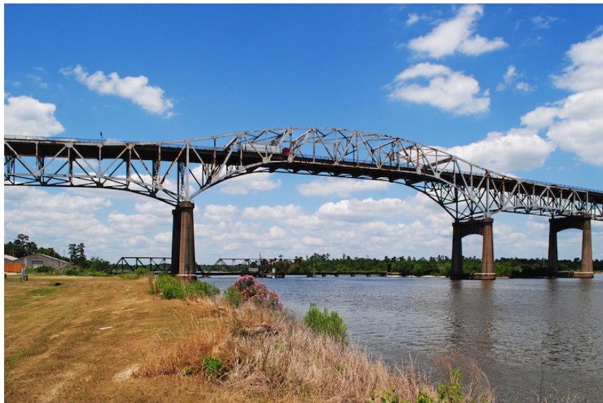
I-10 over Calcasieu River, Lake Charles, Louisiana. ( https://www.flickr.com/photos/nakrnsn/14225200254)

The tax break for Driftwood will be worth $1.4 billion in its first five years. At that point, it can be renewed for an additional five years. Taking depreciation into account, the company will shave $2.4 billion from its tax bill, according to ( https://www.theadvocate.com/baton_rouge/news/business/article_d891ef9e-ff27-11e8-80c4-db16b1d7c2ab.html ) Together Louisiana, which opposed the plan.