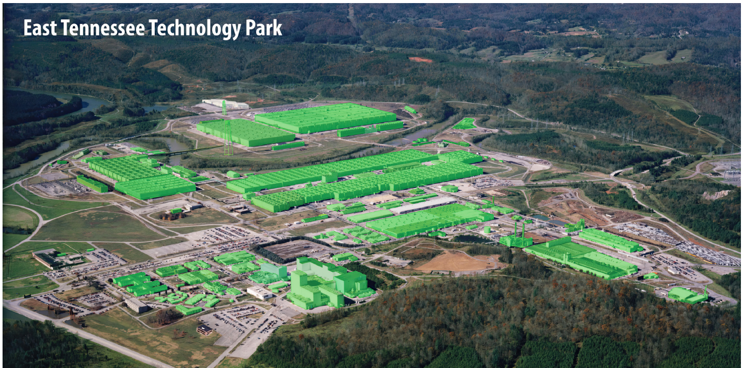
■ – Building demolished

The completion of major cleanup at the East Tennessee Technology Park (a.k.a. Vision 2020) marked a monumental environmental stewardship achievement for the Oak Ridge Reservation.