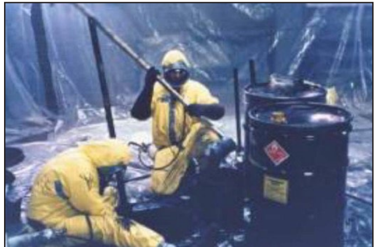
Removing sludge and placing it in drums at the Chicago North site (1987).

February 17, 1989 — DOE published the notice of certification in the Federal Register.