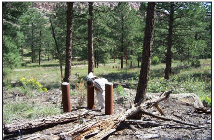
A restricted area monument at the Bayo Canyon, New Mexico, Site (September 2006).