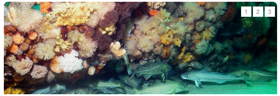
NOAA is committed to improving our understanding and management of human-induced noise and ocean life.