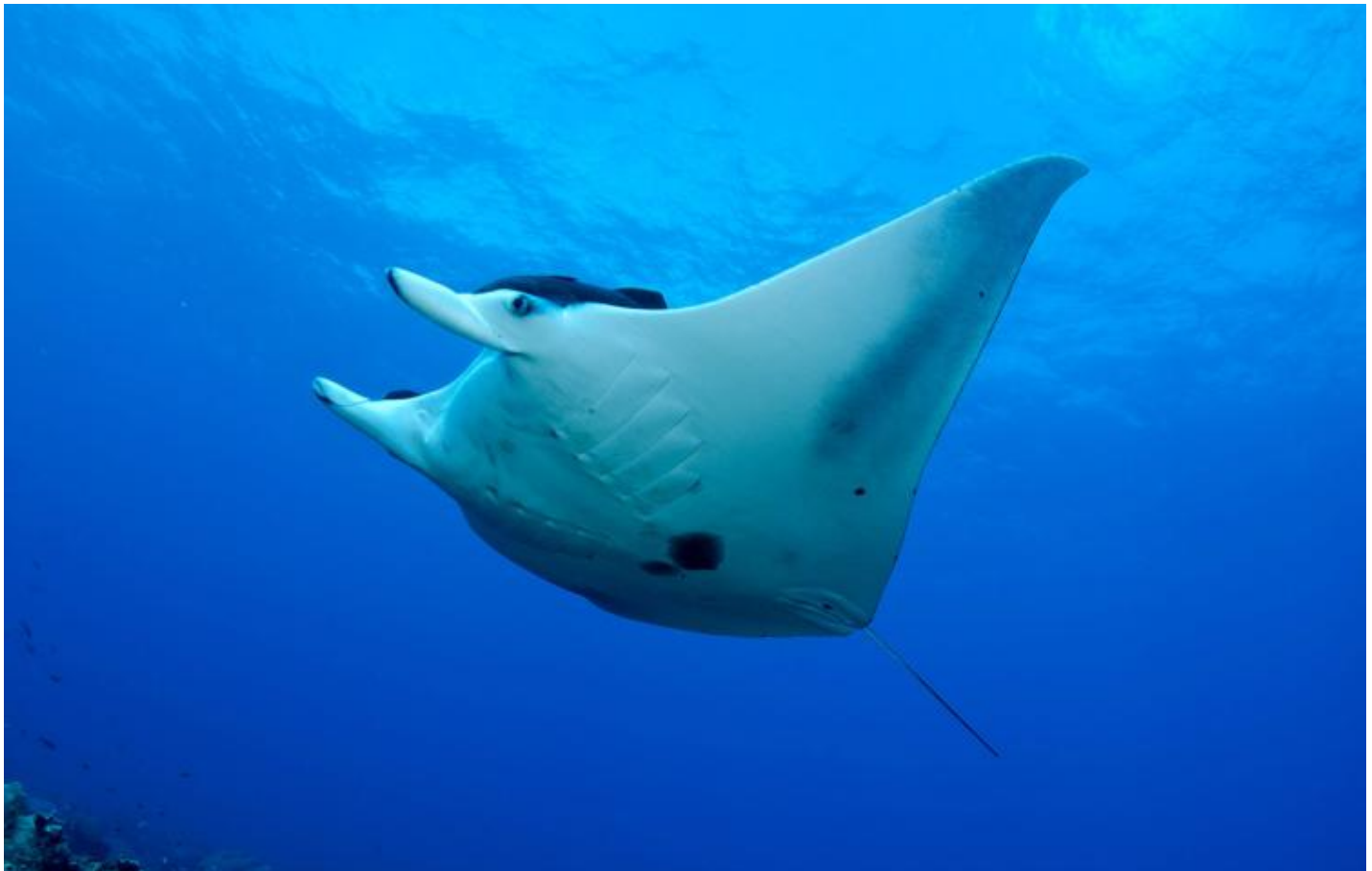
Giant manta ray in Flower Garden Banks National Marine Sanctuary.