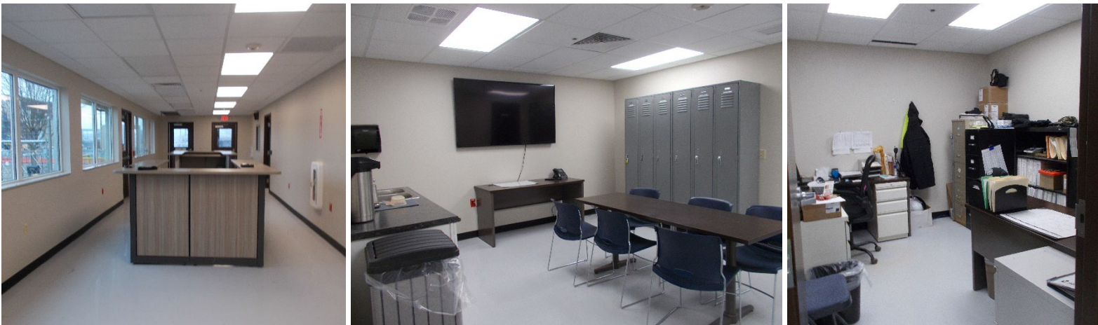
Inside Guard House March 2023