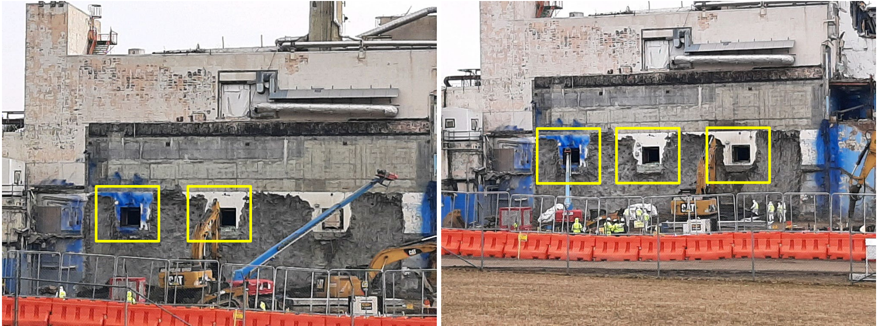
Removal of Chemical Process Cell shield windows