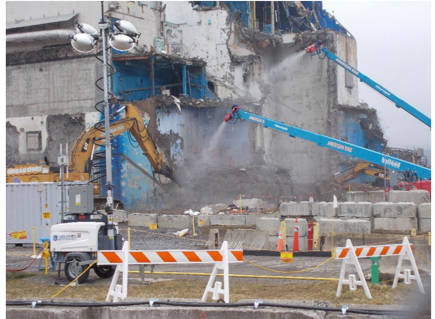
Deconstruction of Acid Recovery Cell – Off-Gas Operating Aisle