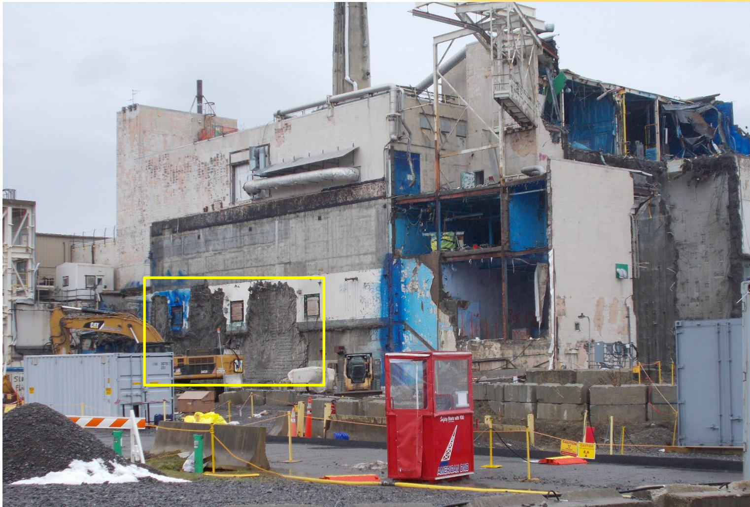
Deconstruction of the Chemical Process Cell west wall by removing the first three (3) feet of wall of the 5-foot-thick wall