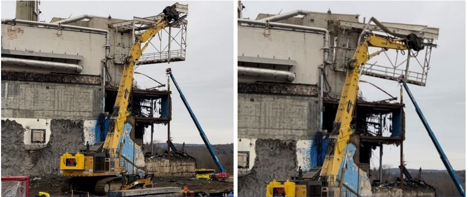
Deconstruction of Extraction Cell Monorail Crane