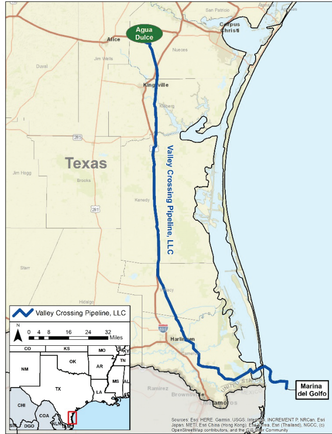
Figure 2. Map showing location of Valley Crossing Pipeline

The Valley Crossing Pipeline connects with the Sur de Texas-Tuxpan pipeline system (owned by a subsidiary of TC Energy), which travels south, offshore in Mexican territorial waters (see Figure 3). 22