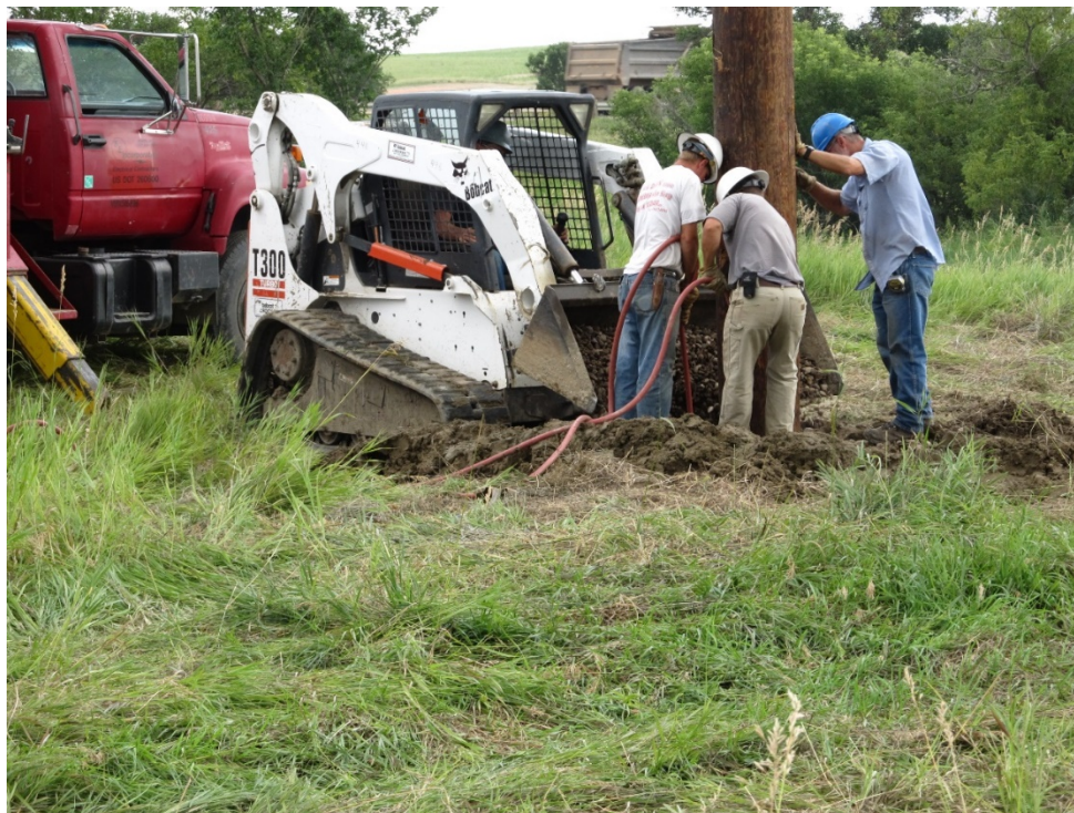
Photo 5: Typical earth disturbance at pole locations during hole auguring.