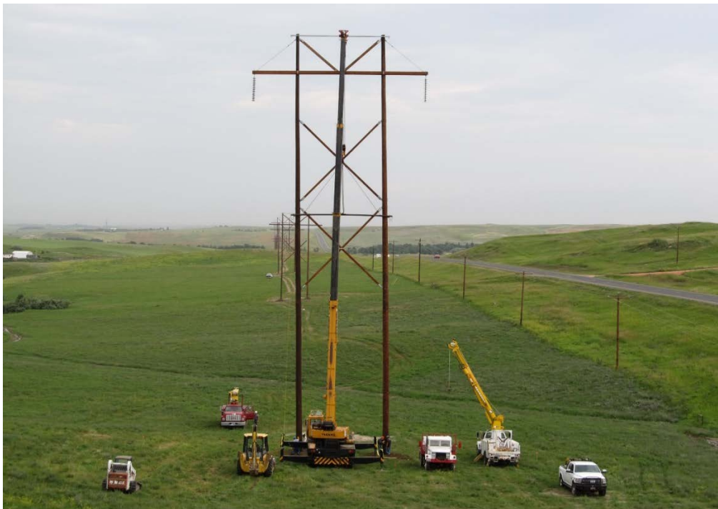
Photo 2: ROW used to traverse from structure to structure. Also an example of the typical landscape of Western North Dakota.