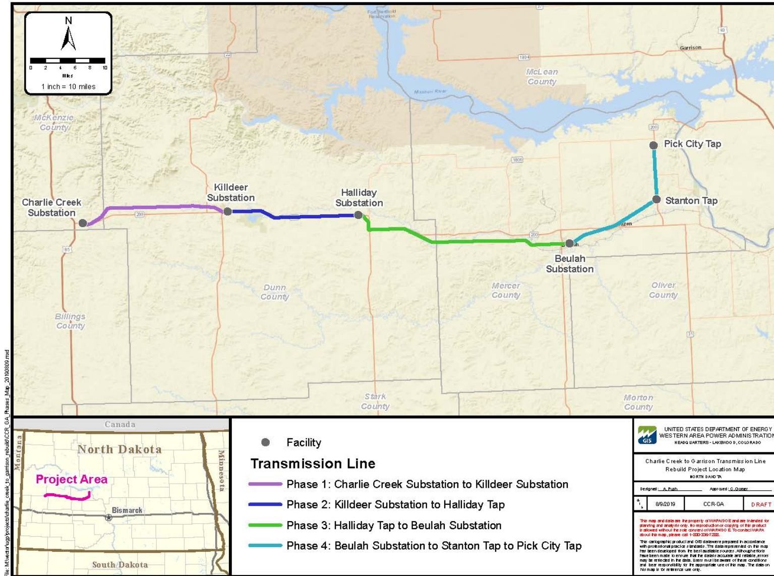
Figure 1: Project Location and Phases