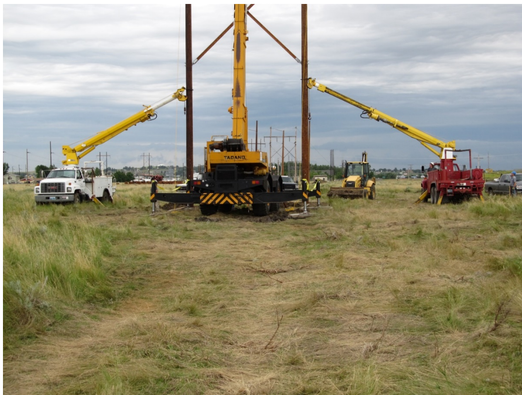
Photo 6: Equipment and disturbance during installation of structures.