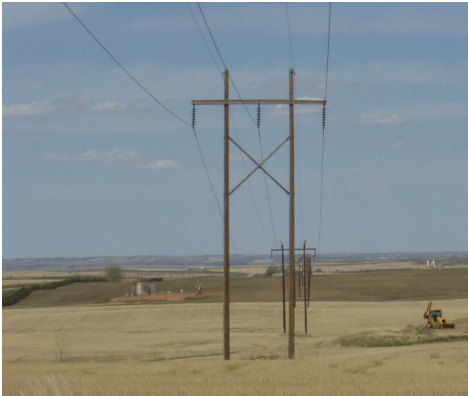
Photo 4: The structure in the foreground is an example of the structure design that WAPA is proposing to install. The structures in the background are the original structures, which WAPA is proposing to replace.