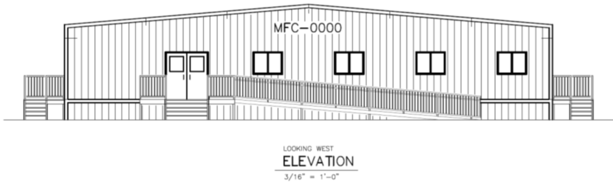
Figure 2. Preliminary visual of building design.