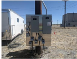
SIMILAR INSTALLATION AT PAD D FOR REFERENCE

SCOPE: EXTEND MEDIUM VOLTAGE POWER LINES TO THE UAV RUNWAY. NEW POLES WILL BE SET APPROXIMATELY AS SHOWN IN THE AREA LOCATION PLAN ON THIS SHEET. A POLE MOUNTED TRANSFORMER WILL BE PROVIDED TO FEED NEW ELECTRICAL EQUIPMENT MOUNTED TO AN ALUMINUM BACK BOARD INSTALLED ON THE FINAL POWER POLE. INSTALLATION DETAILS ARE SHOWN ON SHEET 2 AND WILL LOOK SIMILAR TO THE INSTALLATION AT PAD D SHOWN, PHOTO INCLUDED FOR REFERENCE.