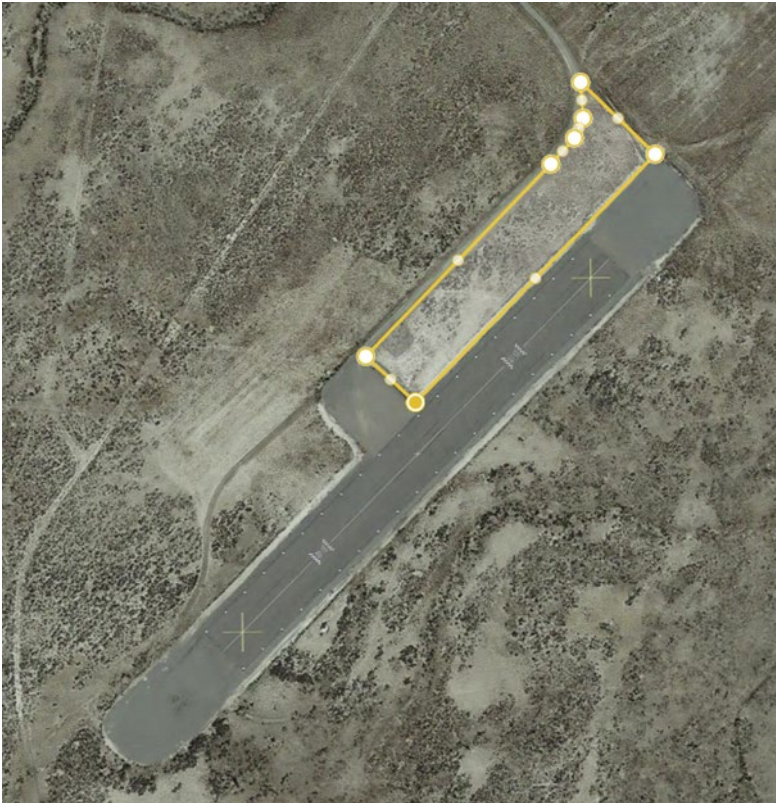
Figure 3-1. Proposed Location of Large Gravel Area