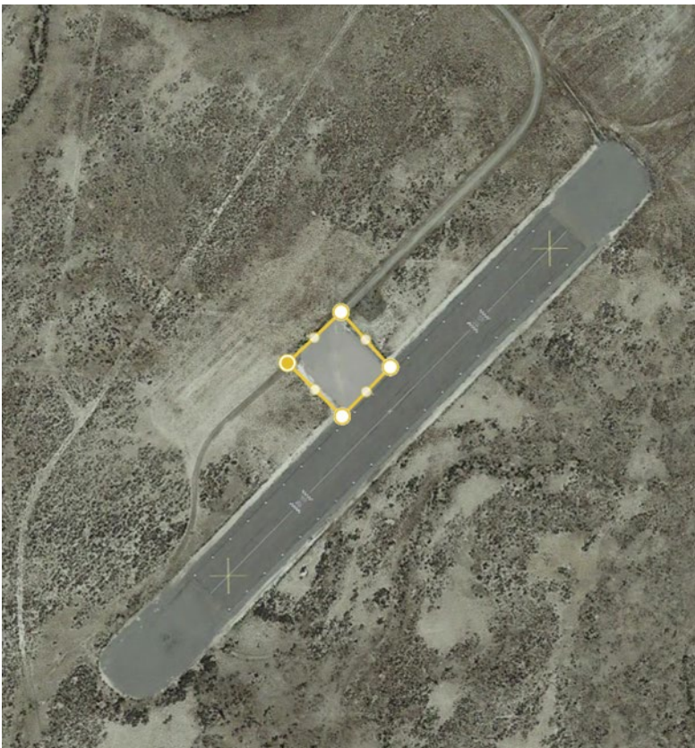
Figure 3-2. Proposed Location to be Paved with Asphalt