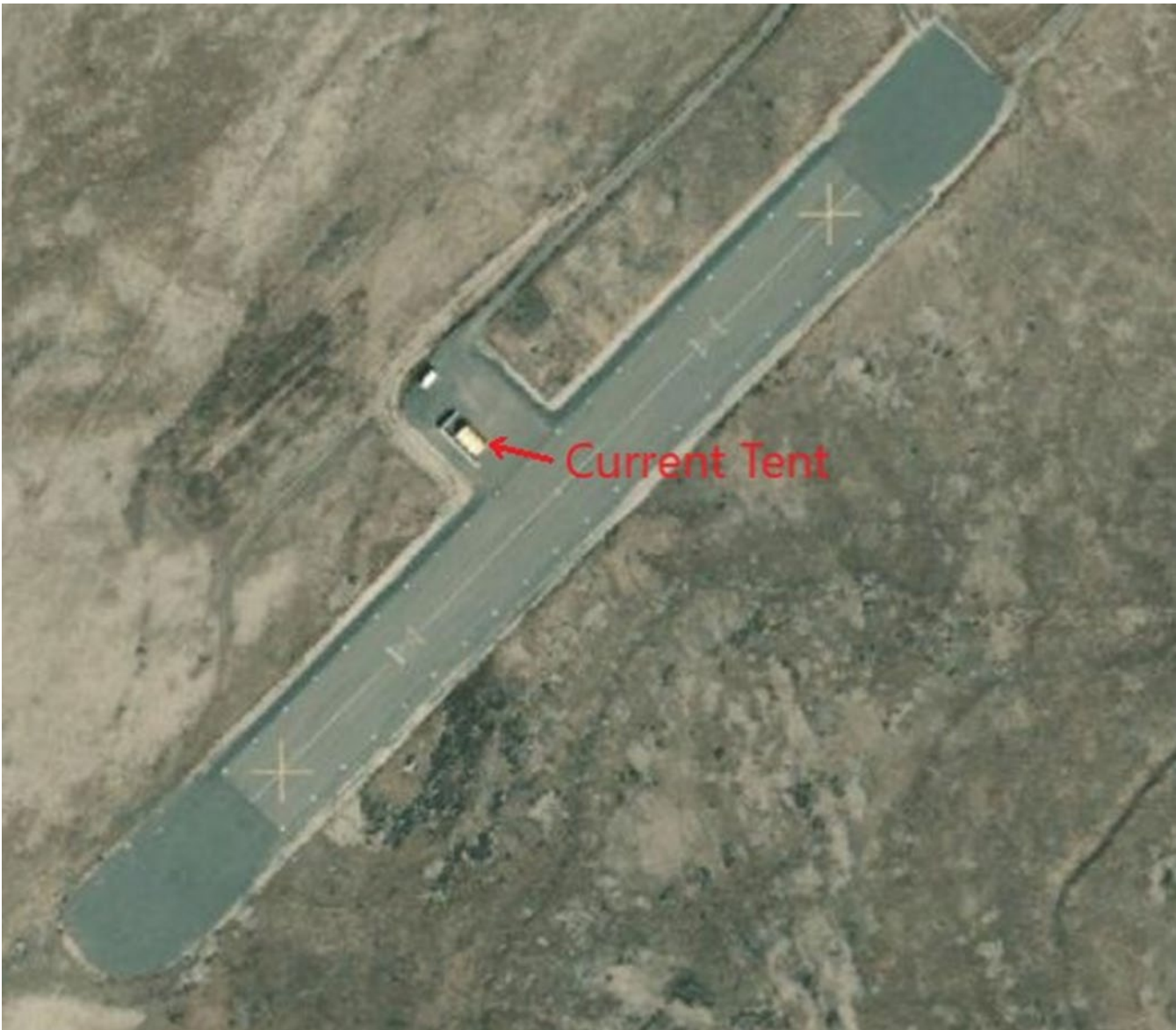
Figure 2-2. Current Location of the Tent at UAS Runway