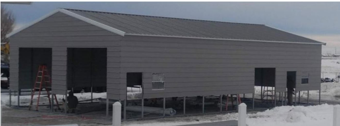
Figure 2-3. Example of the Steel Structure