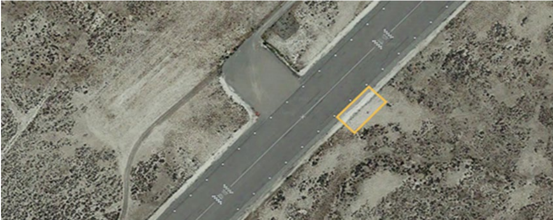
Figure 4-1. Proposed location of New Gravel Pad

The project is seeking to create another gravel pad (50' x 100'). This pad will be on the east side of the runway near its center. See Figure 4-1. The pad will be used for launching large drones. The carbon fiber rods used for launching don't survive very well when they impact the asphalt. The rods seem to do well on dirt and gravel.