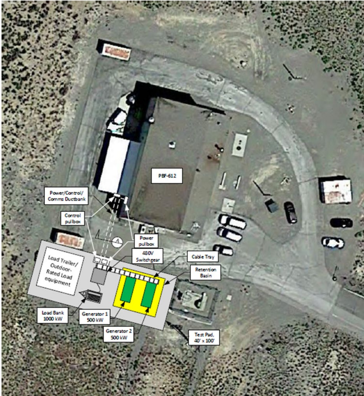
Figure 1. Proposed Equipment Layout.

Figure 1 shows the layout of the generators and associated equipment on the test pad along with the proposed ductbank. The test pad would be sited in a previous disturbed area. The generators are approximately 86" W X 188" L X 117H and weigh 16,879 lbs each.