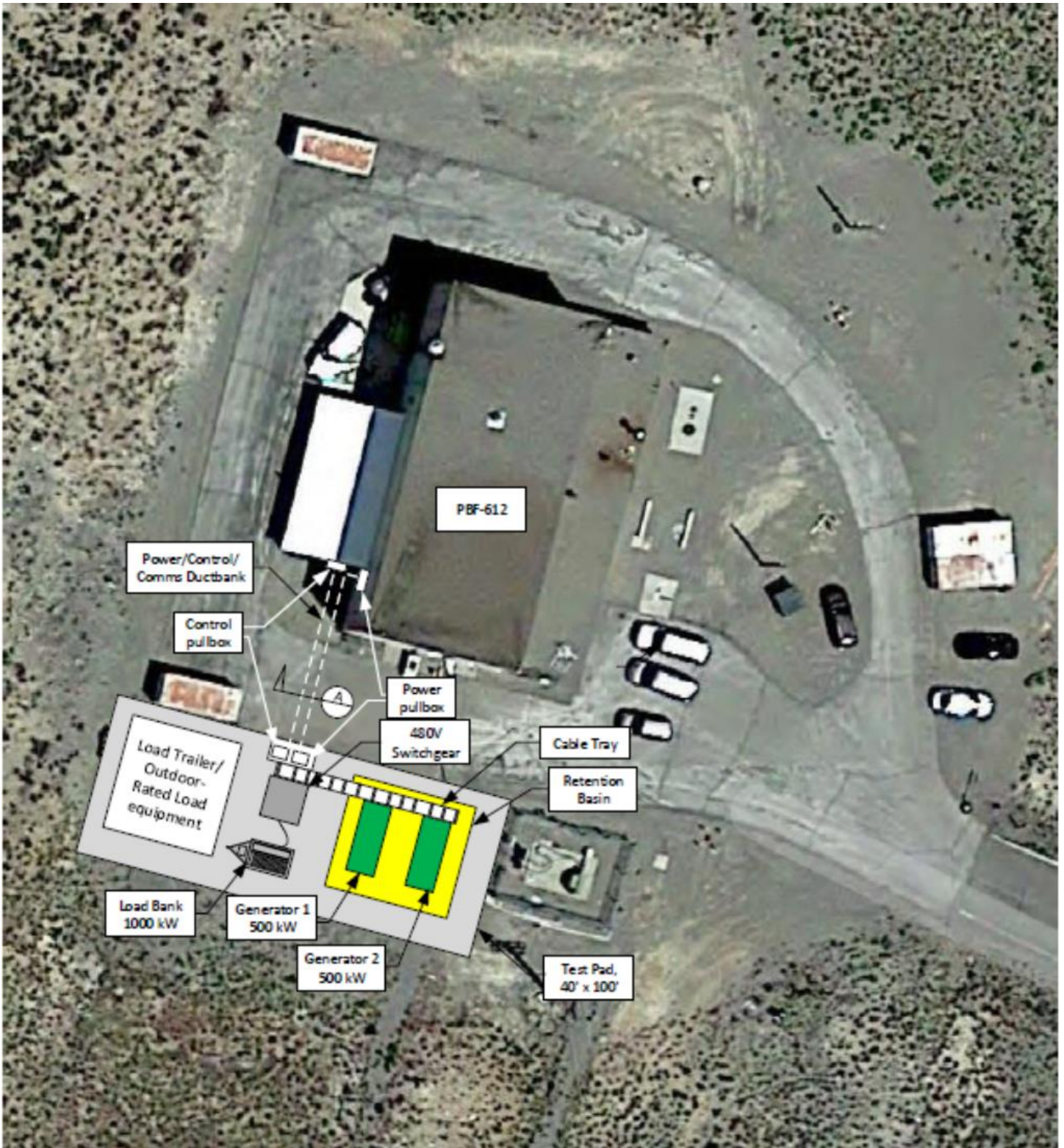
Figure 1. Proposed Equipment Layout.

Figure 2 shows an example of the load bank. Some of the equipment may be run to end of life, in which case it will be excessed or otherwise disposed of. Some equipment may be repurposed for future testing.