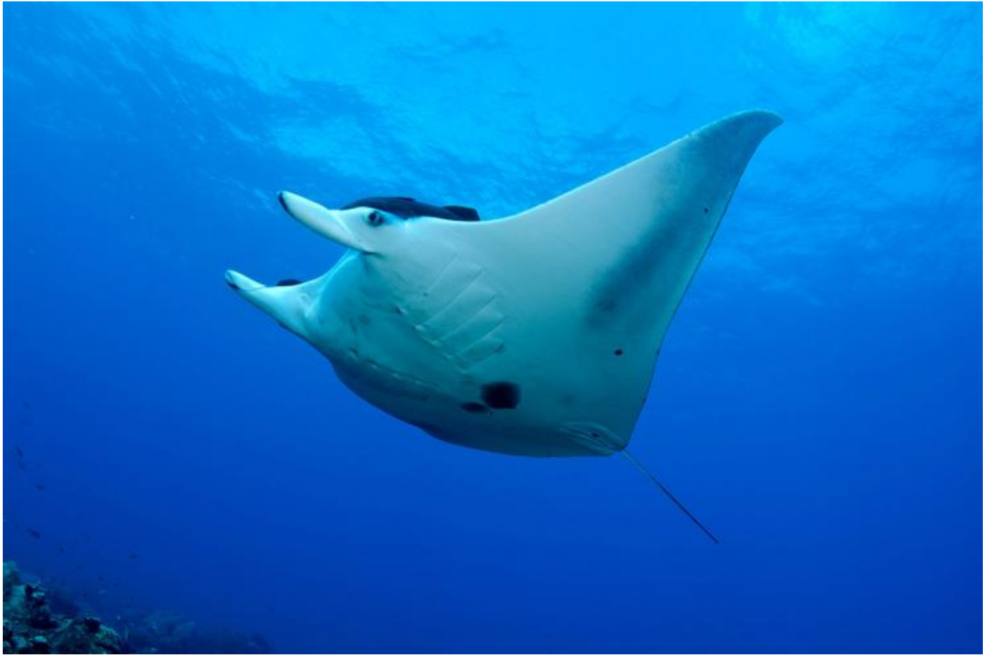
Giant manta ray in Flower Garden Banks National Marine Sanctuary.

The giant manta ray is the world's largest ray with a wingspan of up to 30 feet. They are filter feeders and eat large quantities of zooplankton. Giant manta rays are slow-growing, migratory animals with small, highly fragmented populations that are sparsely distributed across the world.