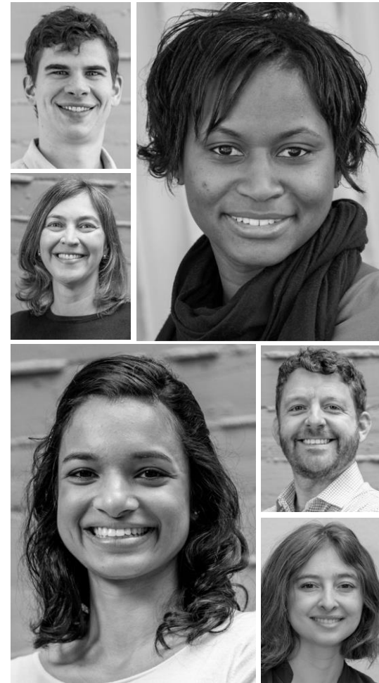
SELECT ACTIVATE FELLOWS

$32.4M in total revenue earned by Activate companies