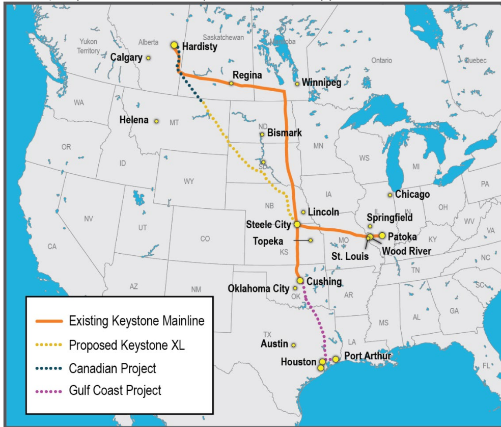
Figure 2 – Map of Existing Keystone Pipeline and Proposed Expansions (adapted from State Department Final Supplemental EIS, 2014)