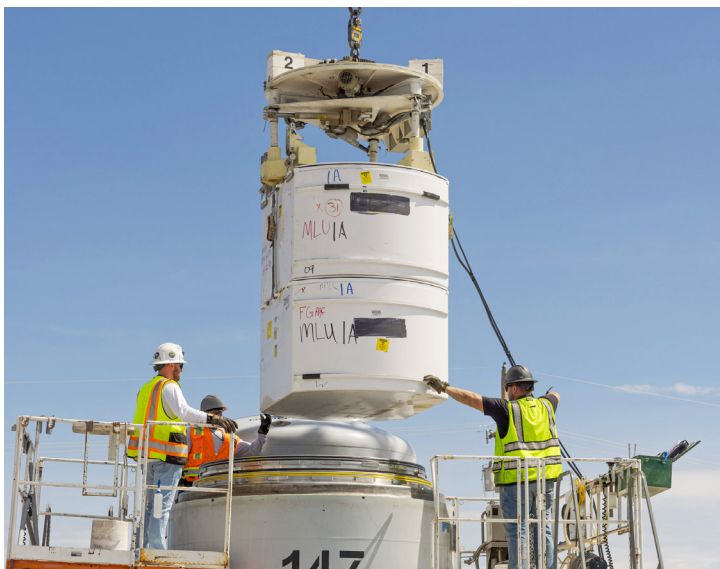
Crews at Technical Area-54, Area G use a mobile-loading unit to place containers of legacy TRU waste at LANL into casks for transport to WIPP.

EM-LA commenced retrievals of the 158 corrugated metal pipes (CMPs)—containing cemented waste from a former LANL radioactive liquid waste treatment facility—at Technical Area-54, Area G. After retrieval, the CMPs will be characterized and resized for shipment to WIPP.