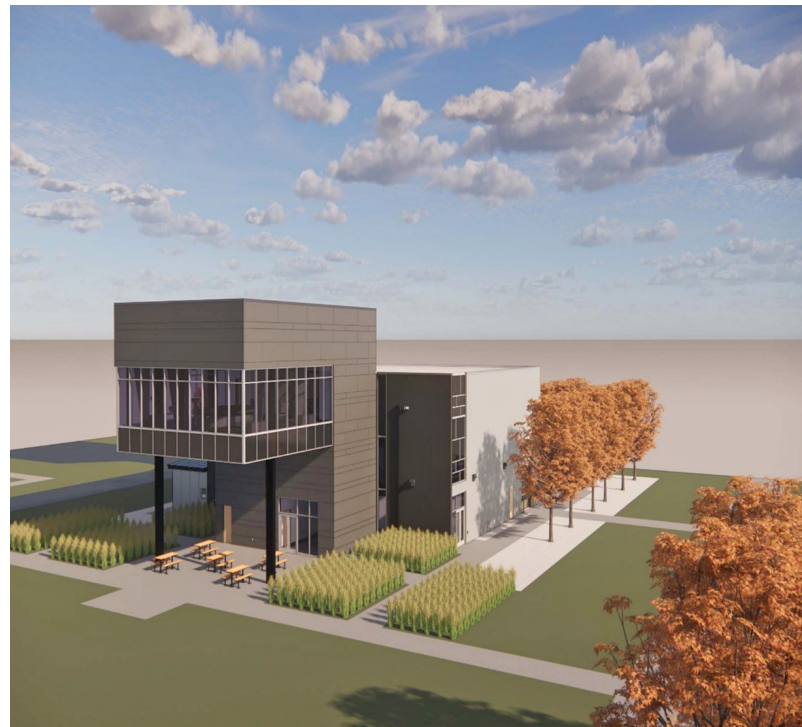
As part of the national park, this rendering shows a viewing platform overlooking the footprint of the former K-25 building site.

EM is also working to transfer all cleaned parcels back to the community that can be reused for economic development. These efforts are attracting major industry to the site and bringing in hundreds of millions in new investments at ETPP.