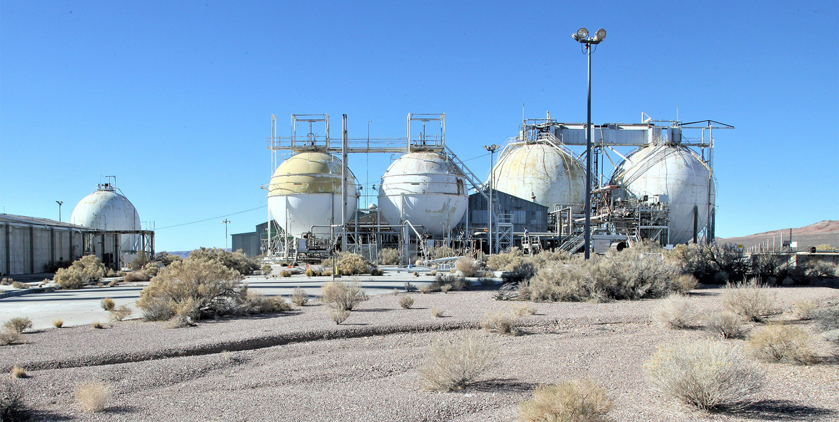
Characterization is underway in preparation for demolition and closure of the TCC facility.