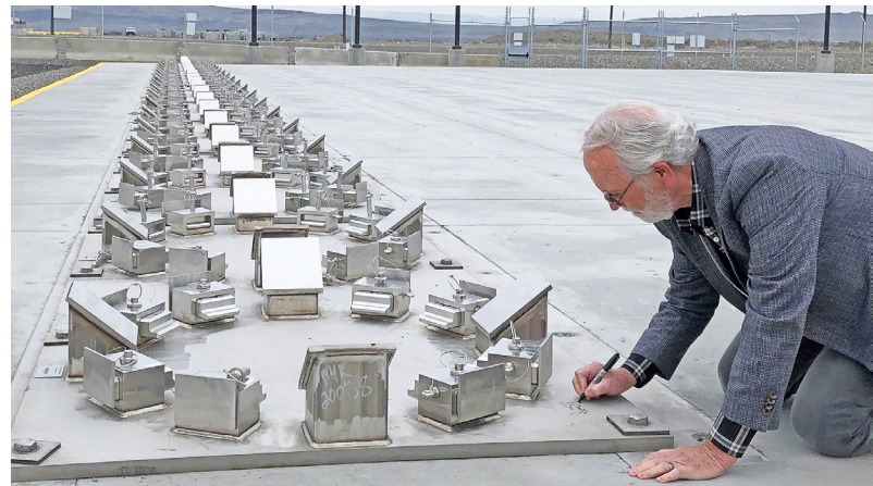
To mark Hanford Site’s progress in treating waste from underground tanks with the TSCR System, U.S. Representative Dan Newhouse signs his name on the base of the TSCR Ion Exchange Column Storage Pad.

Throughout the year, crews at the WTP continued commissioning major systems and building operator proficiency on systems that will immobilize tank waste in glass in two large melters in the plant’s Low-Activity Waste (LAW) Facility.