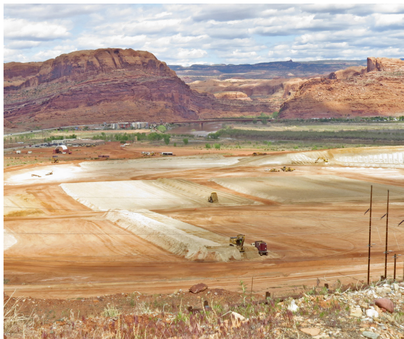
The Moab site tailings “pile.” Rows of tailings are dried out before being loaded into specialty train containers, which are carried by haul trucks to the train and then loaded and transported to the disposal cell.