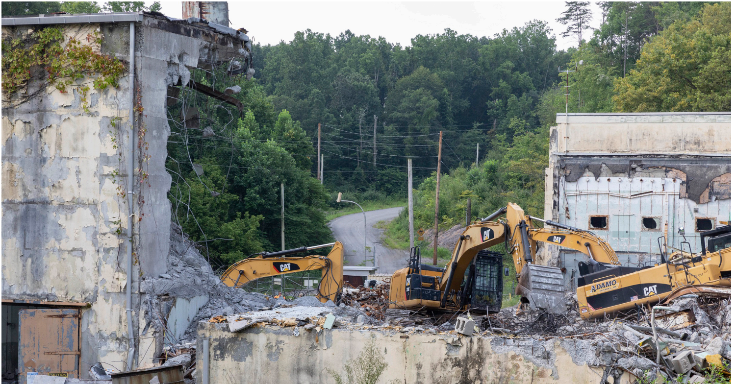
A view of crews demolishing the Criticality Experiment Laboratory at Y-12.

Crews were also busy taking down excess contaminated facilities in 2022 that included the Criticality Experiment Laboratory at Y-12 and the Bulk Shielding Reactor at the Oak Ridge National Laboratory (ORNL). Both of these buildings were more than 70 years old, and their removal eliminates high-risk buildings and opens land for future missions. The Bulk Shielding Reactor project marks the first removal of former reactor facility in ORNL's central campus area.