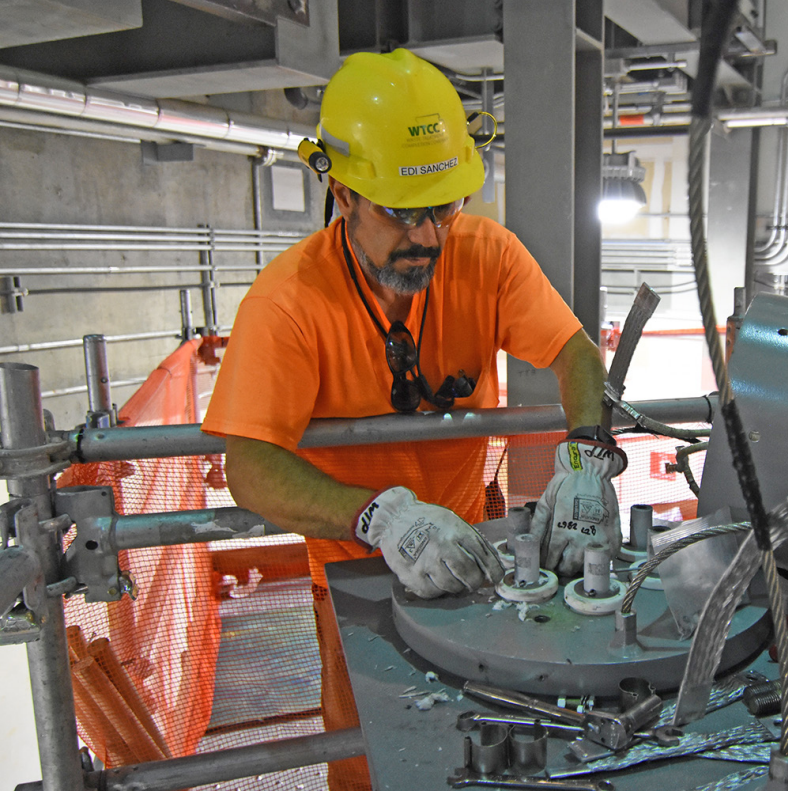
A Vit Plant electrician assembles temporary heaters that started up the first melter inside the plant's Low-Activity Waste Facility at the Hanford Site.

Hanford took another major step toward the start of tank waste vitrification when workers initiated heat up of the first melter in the LAW Facility. The detailed and methodical process for melter heat up has been planned in a way that allows for issues identified during the complex startup to be effectively and safely addressed.