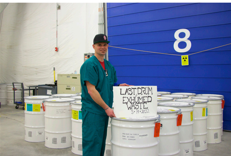
An ARP employee displays a drum containing the last exhumed waste from the ARP IX facility.

EM’s contractor retrieved the last of the Advanced Test Reactor’s (ATR) SNF elements from Chemical Processing Plant (CPP)-666’s basin at the Idaho Nuclear Technology and Engineering Complex and transferred them to a nearby dry-storage facility. Another milestone was met in August as crews completed the 100th shipment of Experimental Breeder Reactor-II (EBR-II) fuel to the Radioactive and Scrap Waste Facility at the Materials and Fuels Complex (MFC). Fewer than 20 shipments of EBR-II to MFC remain to empty the CPP-666 basin and complete the 1995 Idaho Settlement Agreement milestone.