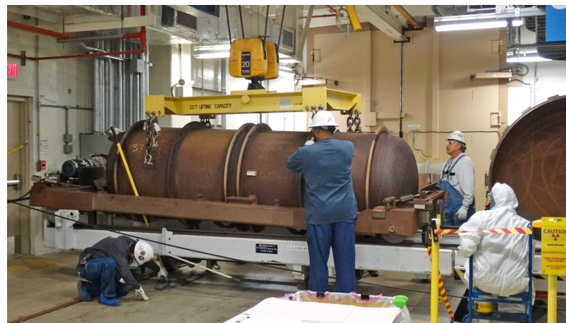
Crews load a non-standard CV-12 cylinder into the Cylinder Transfer System autoclave.

At Paducah, groundwater contamination remains the largest environmental concern at the site. Since the 1990s, a number of remedies have been successfully implemented to decrease the reach of the contamination, including the 2021 implementation of a bioremediation action to remove approximately 95 percent of the contaminant mass in the southwest area of the site. The site moved towards elimination of the largest source of groundwater contamination with the ongoing C-400 city block project.