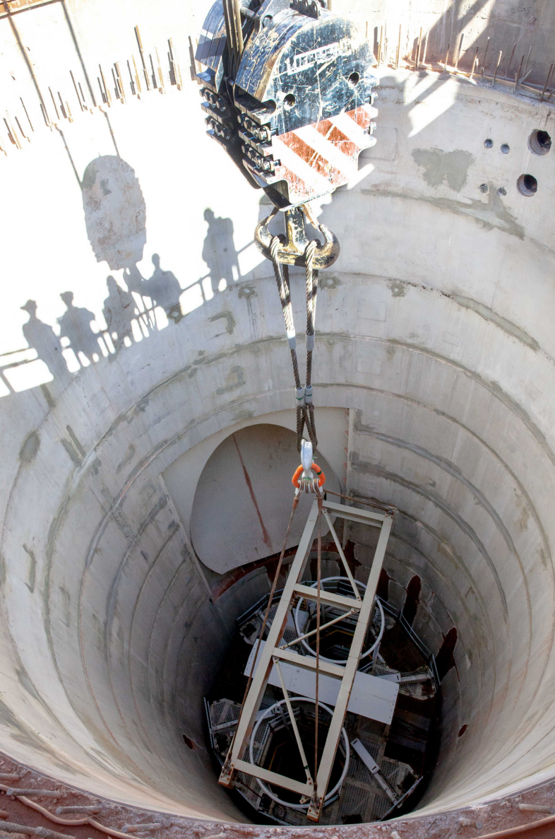
The shadows of construction employees are visible as they look down the new Utility Shaft, which will be the largest diameter shaft at WIPP when completed.

The SSCVS will be the largest containment fan system in the DOE complex and will significantly increase airflow underground, enabling increased waste emplacement and facility mining operations.