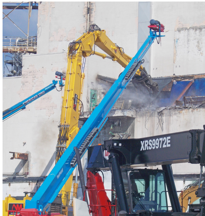
Workers commence Main Plant Process Building demolition on the Solvent Storage Terrace.

The workforce conducted significant work over the past two decades to prepare the MPPB for demolition in a manner that is protective of human health and the surrounding environment. This included the reduction