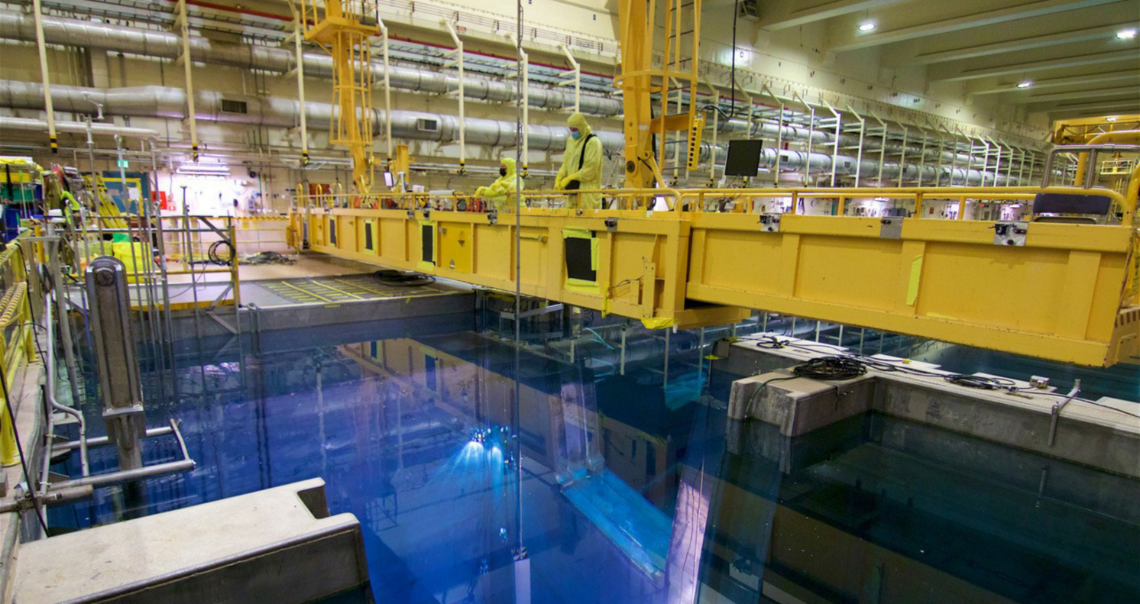
SNF handlers remove the last ATR fuel element from the CPP-666 storage basin.