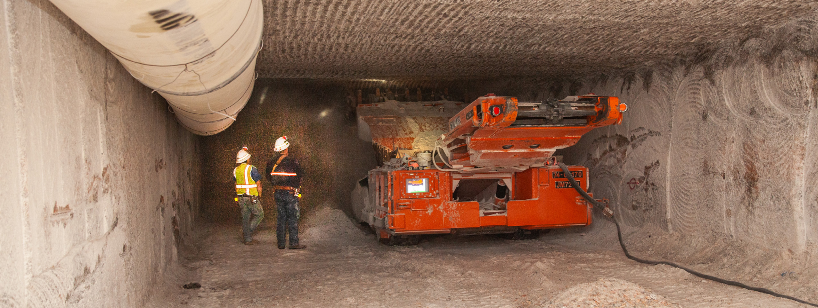
Mining activities continue in the WIPP underground as new pathways are mined toward the west.