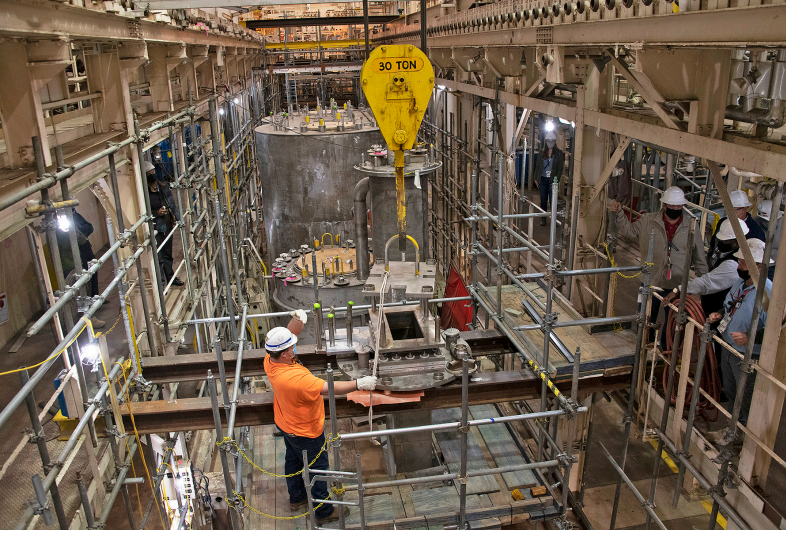
An electrolytic dissolver, used to dissolve stainless-steel clad fuel, was installed in H Canyon.

Workers at the K Area Complex continued making progress in Savannah River's mission to downblend surplus plutonium for disposition. Over the course of 2022, they exceeded downblending expectations ahead of schedule, and achieved readiness to ship the downblended material as transuranic, or TRU, waste to the Waste Isolation Pilot Plant (WIPP).