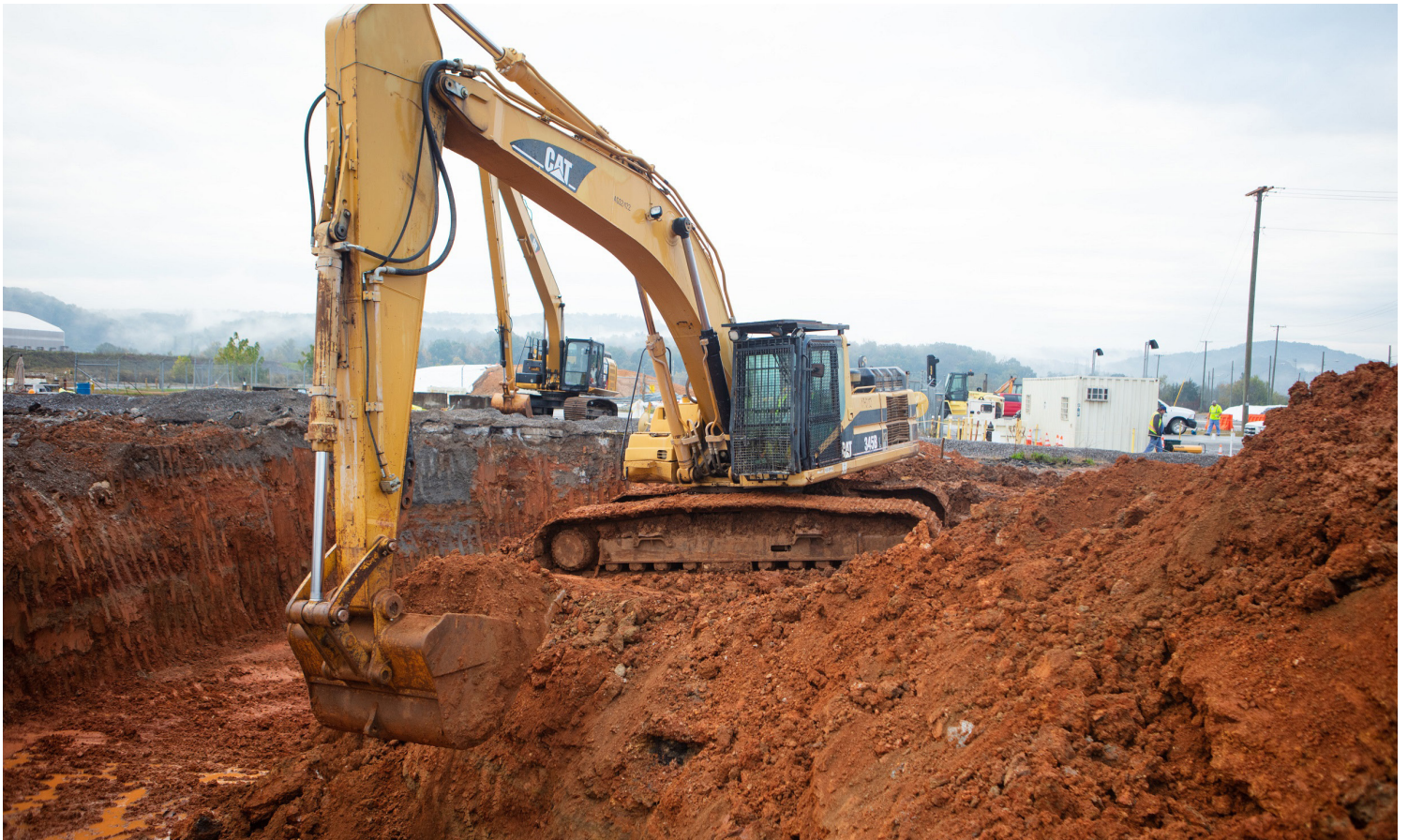
Workers clean up a contaminated area in the middle of the Building K-25 footprint at ETPP.