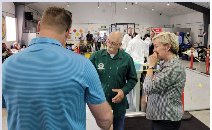
DOE Secretary Granholm visits the Volpentest HAMMER Federal Training Center at the Hanford Site.

Today, the EM program is at a crossroads. After more than 30 years of mitigating the most pressing environmental risks, the program is now shifting to the remaining work that involves some of the toughest and most expensive challenges. At EM, this has led to a set of strategic initiatives to ensure the program is ready for the future. Chief among these is work underway to recruit, develop and maintain the next-generation workforce EM will rely on for years to come. EM achieved a 2022 priority with the development of a program-wide succession plan to help identify and develop the next generation of program leaders.