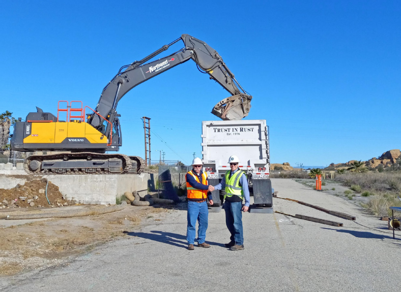
EM's federal project director at ETEC (right) shakes hands with a California Department of Toxic Substances Control Engineering Geologist as the last trucks of demolition waste safely left the site.