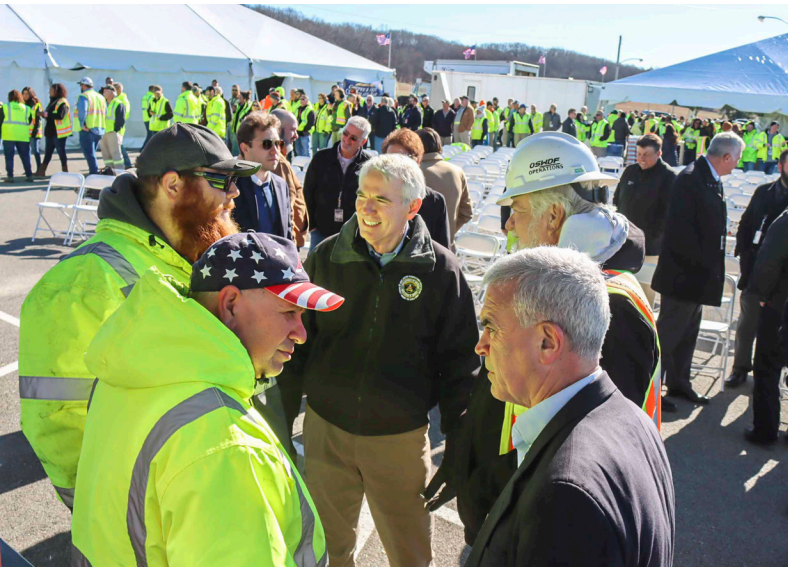
Senator Rob Portman (center) and Representative Brad Wenstrup (bottom right) speak to site employees following the recent Past, Present, Future Celebration at the Portsmouth Site.