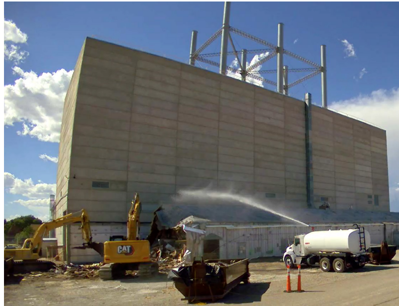
Crews demolish buildings B608/625 at the NRF.

After a nearly decade-long hiatus from decontamination and demolition work, crews completed the demolition of buildings B608/625 at the Naval Reactors Facility (NRF). The 10,000-square-foot, single-story buildings were used for training and maintenance activities in support of the S1W reactor mission. The S1W reactor was the prototype power system for the USS Nautilus, the world's first nuclear-powered submarine. It was shut down in 1989.