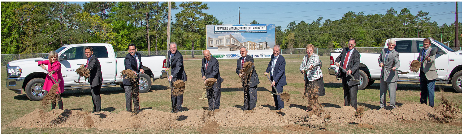
Officials participate in the groundbreaking of the AMC facility on the USC Aiken campus.

SRNL, in its first year as a standalone national laboratory, also established the Regulatory Center of Excellence. This capability brings together a diverse network of experts and researchers charged with helping EM and others manage complex issues involving science, government, and communications.