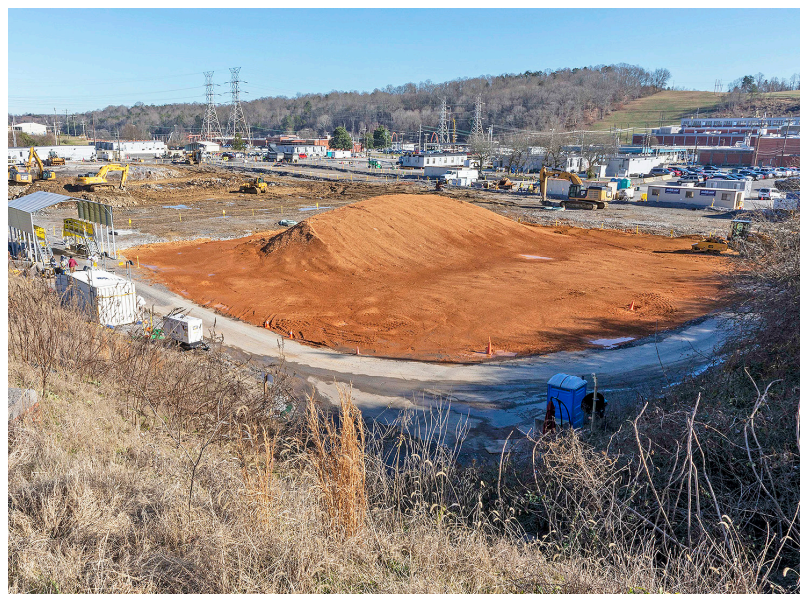
Soil is brought in to backfill the former Biology Complex area after slab removal.

OREM completed a 2022 EM priority by completing cleanup and transferring the former Biology Complex area to the National Nuclear Security Administration (NNSA) at the Y-12 National Security Complex (Y-12). This project provides NNSA an 18-acre area they can reuse as the location for its Lithium Processing Facility that will support national security missions at the site.