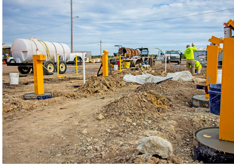
Wells are installed and grouted on the Solid Waste Management Unit 211-A Bioremediation project at the Paducah Site.

A unique regulatory agreement with the state of Ohio allows for the excavation of previously closed landfills and plumes within the site's Perimeter Road to provide necessary fill for the Portsmouth Onsite Waste Disposal Facility (OSWDF). This year, crews completed excavation of the X-231B landfill, generating 195,000 cubic yards of fill for the OSWDF. This long-term strategy will leave up to 1,000 contiguous acres available for community reuse.