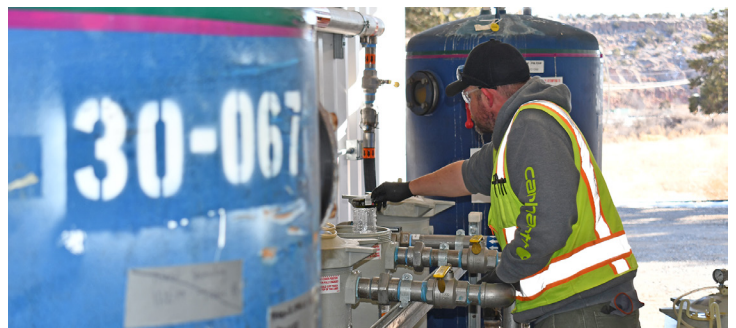
A crew member checks an Ion Exchange Unit where groundwater contaminated with hexavalent chromium is treated as part of the Interim Measures operations.

Sustained operations of the Chromium Interim Measures system—a combination of extraction, treatment, and injection—to control the hexavalent chromium plume remained a top priority in 2022. EM-LA submitted an updated Chromium Interim Measures and Characterization Campaign Work Plan to the New Mexico Environment Department to meet three primary objectives: (1) prevent migration of the plume beyond the Los Alamos National Laboratory (LANL) site boundary; (2) close data gaps to conduct a corrective measures evaluation; and (3) propose a strategy for the transition to a more full-scale extraction solution. To date, more than 400 million gallons of water has been treated (about 600 Olympic size swimming pools), and 682 pounds of hexavalent chromium has been removed from the regional aquifer.