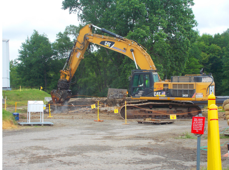
An excavator is used to remove soil, structure debris, and load them into waste containers to be shipped off-site for disposal.

The 4,500-square-foot, two-level building had been used over the years for several purposes, and was no longer needed for EM's cleanup mission at the site.