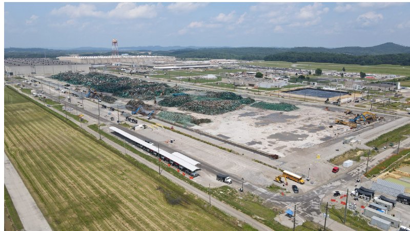
Demolition of the X-326 Process Building at the Portsmouth Site.

In July, PPPO celebrated the most significant cleanup project to date with the completion of demolition of the former X-326 enrichment process building.