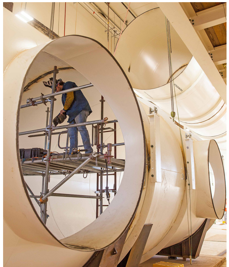
A worker inside the 14-foot ductwork of the SSCVS Project's Salt Reduction Building.

Workers at WIPP continued making progress on a number of projects in 2022, led by the Safety Significant Confinement Ventilation System (SSCVS).