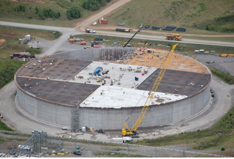
Workers in progress of completing all concrete placements on Saltstone Disposal Unit 9.

This change is a step to ensure the Salt Waste Processing Facility (SWPF) can run at high production rates since DWPF will be able to treat greater quantities of waste due to the stability of the process. In addition, to support the higher production rates coming from SWPF, the Saltstone Production Facility is preparing to move to 24/7 operations in 2023.