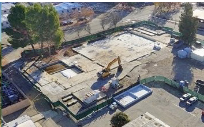
Before and after views of the demolition of Building 175 at LLNL.