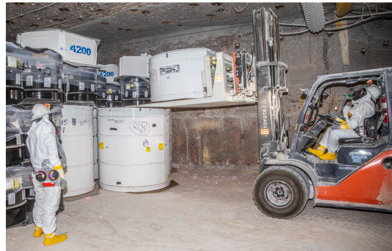
Waste handlers in WIPP's Panel 7 use a push-pull device on a forklift to lift and slide a container into place.

As Panel 7 neared capacity, crews outfitted Panel 8 with power, communications, and air monitors. Panel 7 was officially filled in October. Now that Panel 7 has been sealed, waste emplacement has begun in Panel 8 and can move at a faster pace since workers are no longer required to wear respirators and protective clothing due to contamination issues. Mining at WIPP is timed so that a disposal panel is only ready when it is needed. This is because the natural movement of salt causes mined openings to close at a rate of two to four inches yearly. This closure is attributed to salt rock movement, which eventually permanently encapsulates the waste.