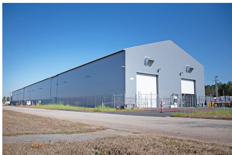
The completed CCO Characterization and Storage pad in SRS’s K Area has the capacity to hold 3,800 CCO drums while awaiting shipment to WIPP.

An important upgrade project was completed at H Canyon with the installation of an electrolytic dissolver. This new capability will allow for the dissolution of stainless-steel clad fuel from foreign research reactors.