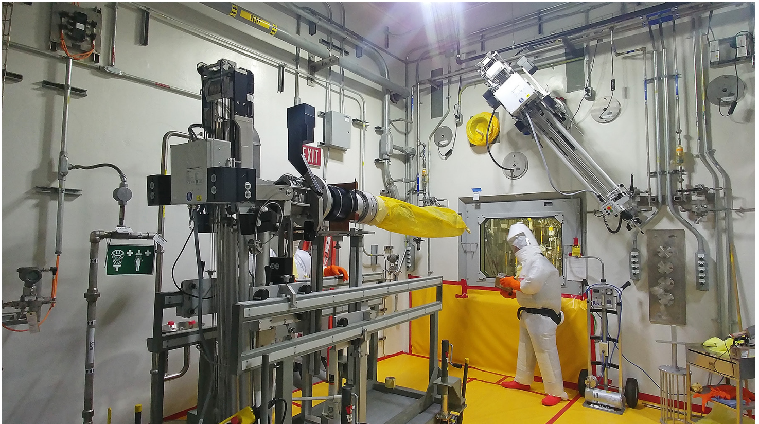
The SWPF laboratory uses manipulators to handle process samples and equipment within its radioactive cell, which help protect workers handling the radioactive materials

The Defense Waste Processing Facility (DWPF) underwent a significant process improvement this year with the implementation of a key processing chemical used in the vitrification plant's flowsheet. Glycolic acid replaced formic acid, allowing for safer and more efficient processing of high-activity radioactive waste at DWPF, leading to more efficient conversion of waste into glass.