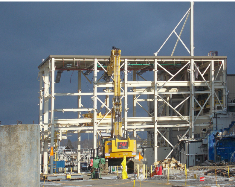
Workers complete the demolition of the Load-In Facility.