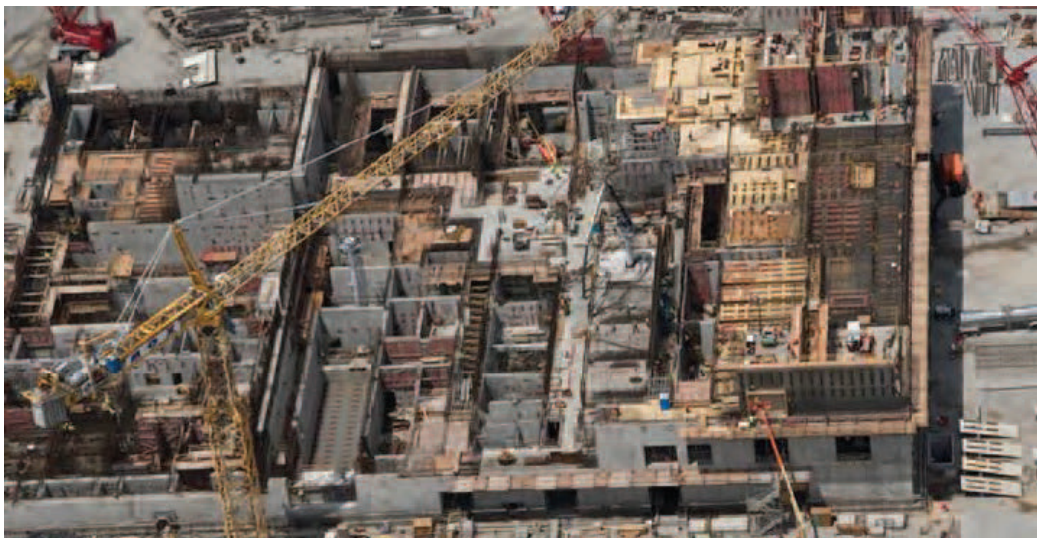
Department of Energy, Savannah River Site - Mixed Oxide Fuel Fabrication Facility Under Construction

The medical screening protocol provides a list of the hazards, the organs targeted by the hazard, potential health outcomes, screening tests, and tests offered during rescreen exams within the FWP.