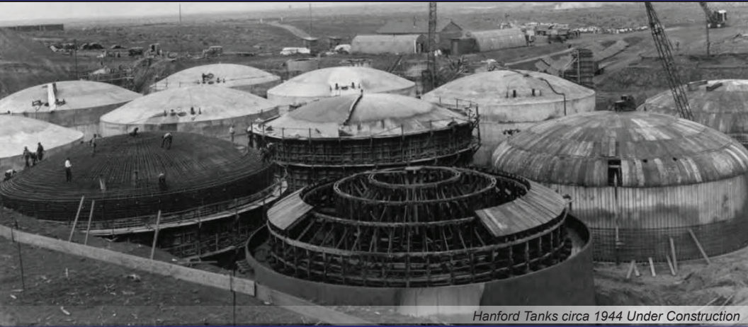
Hanford Tanks circa 1944 Under Construction