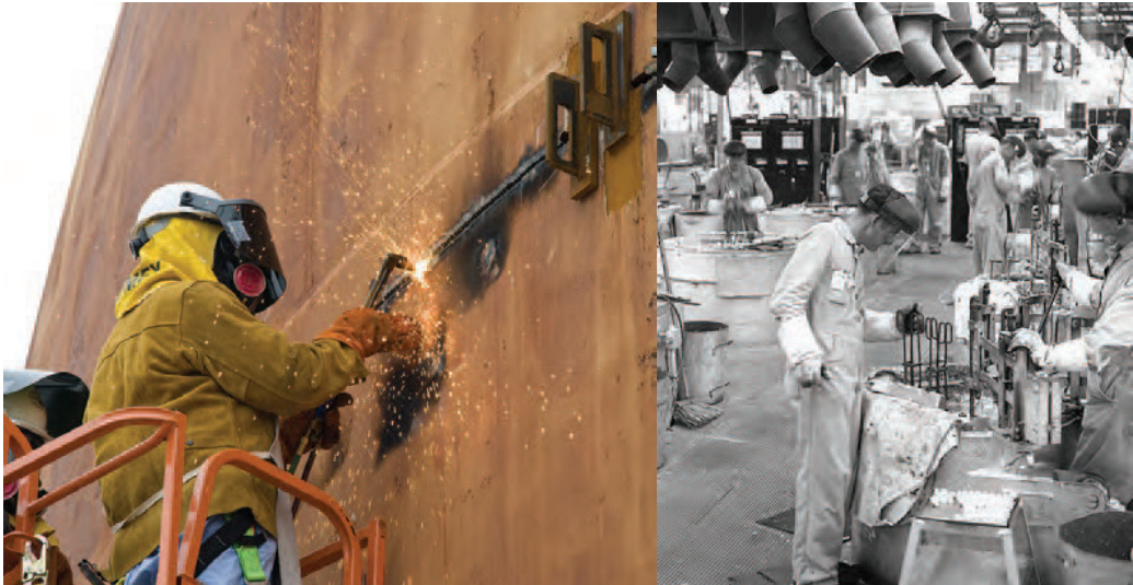
Department of Energy, Savannah River Site