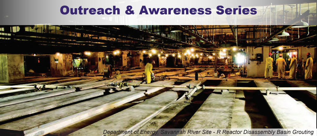
Department of Energy, Savannah River Site - R Reactor Disassembly Basin Grouting

Office of Environment, Health, Safety and Security (EHSS)