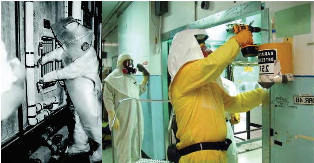
Department of Energy, Hanford Site

There are approximately 600,000 former workers believed to have worked within the DOE complex, or for its predecessor Agencies, during the past 60-plus years, who are eligible to participate in the program.