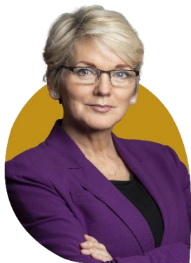
Jennifer M. Granholm