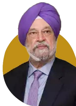
Hardeep Singh Puri

Minister of Petroleum and Natural Gas & Minister of Housing and Urban Affairs Government of India