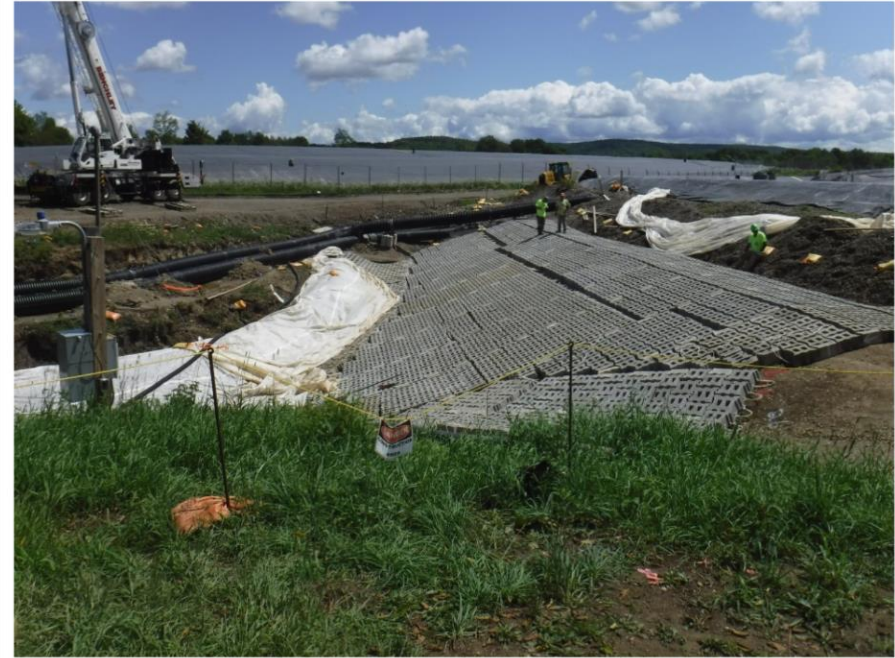
Placement of ACB Mats