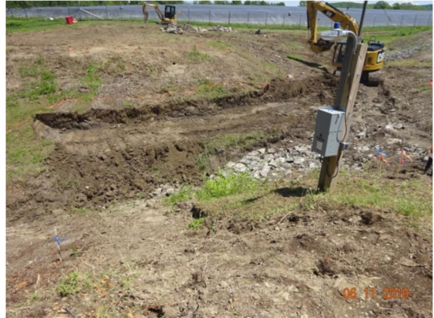
Early Stages of Excavation