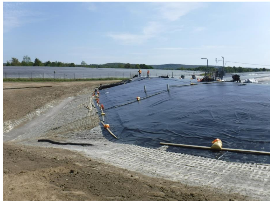
Tying in North Slope of NDA Cap with Armoring