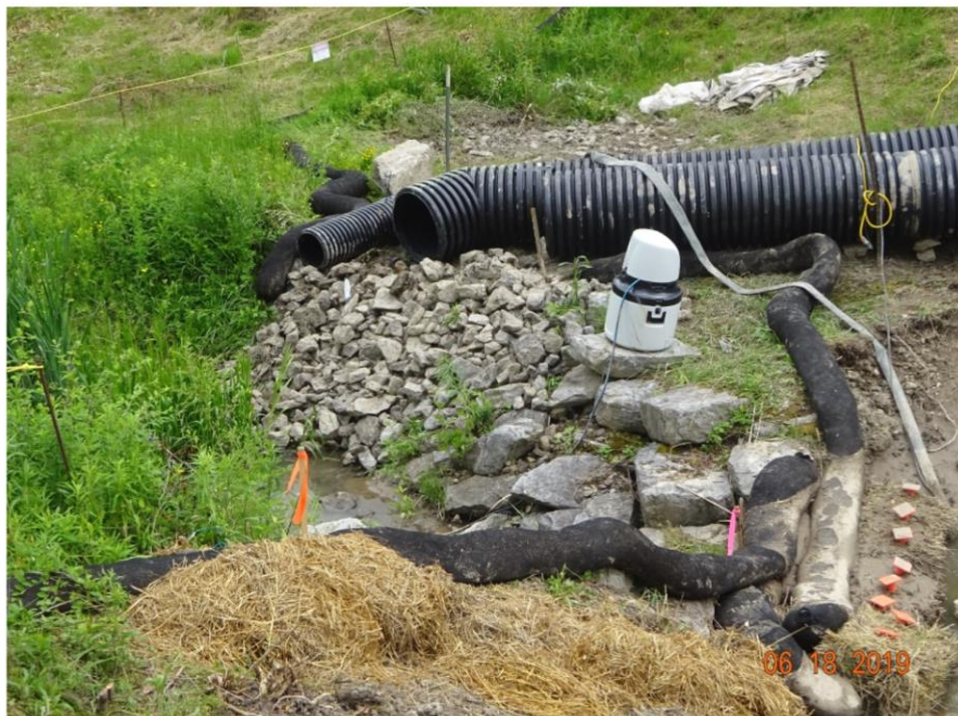
Stormwater Bypass Pipe Outlets and Erosion Control