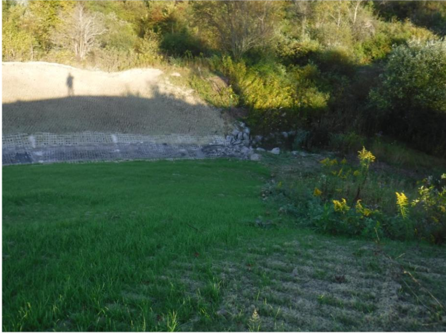
Vegetation starting within ACB on North Slope