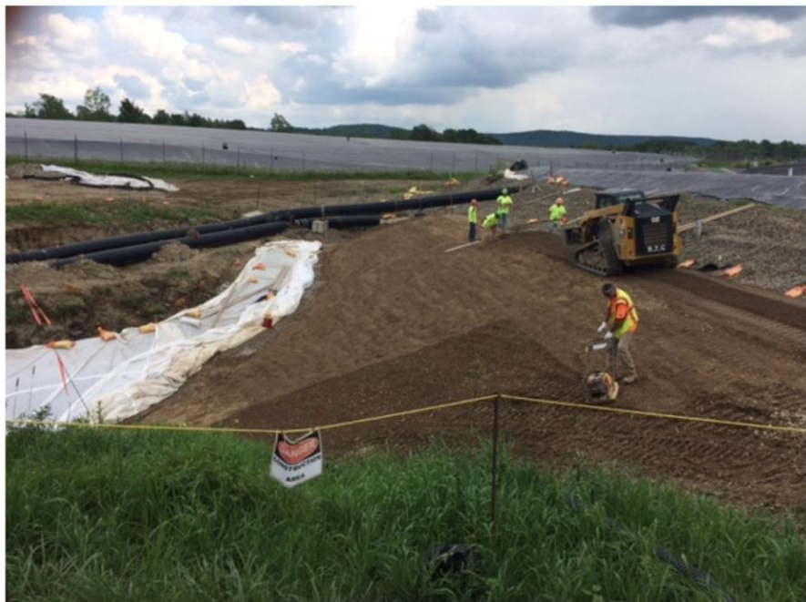
Final Stages of Excavation