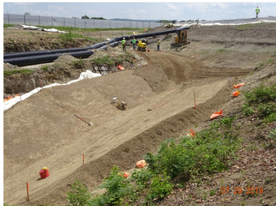
Final Stages of Excavation