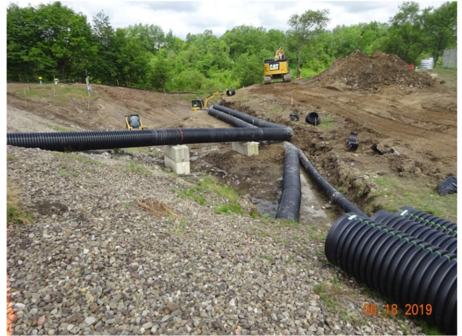
Temporary Stormwater Bypass Pipes