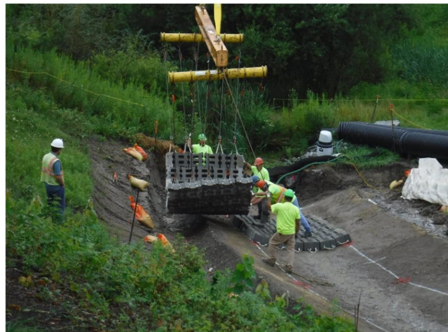
Placement of Articulated Concrete Block (ACB) Mats