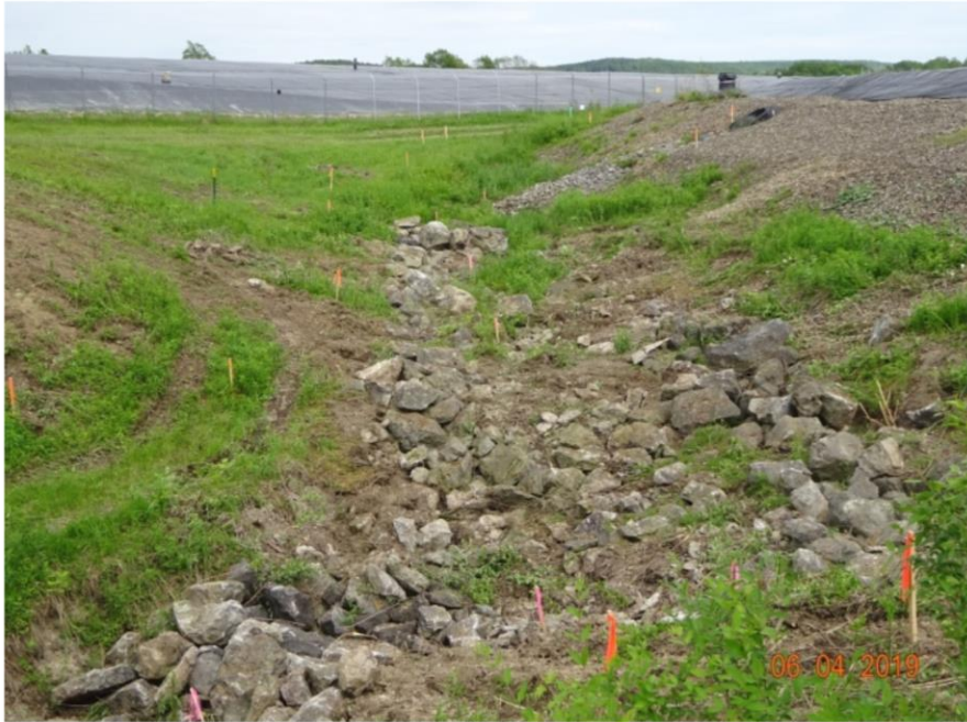
Before Armoring Excavation Initiated